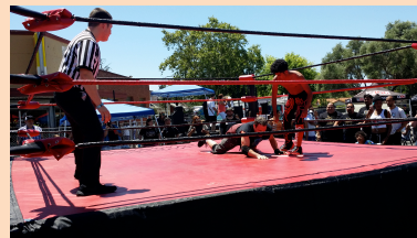
Lucha Libre (Professional Wrestling)