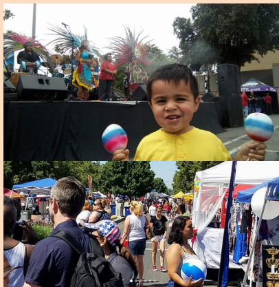
A Real Crowd Pleaser