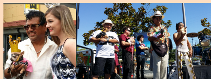
Nor Cal's Chihuahua Beauty Contest