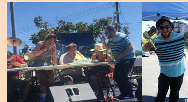
Taco Eating Contests