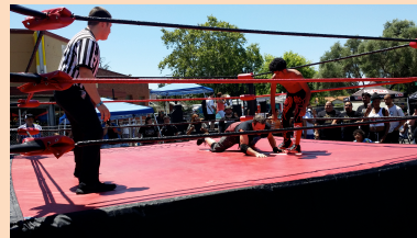
Lucha Libre (Professional Wrestling)