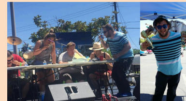
Taco Eating Contests