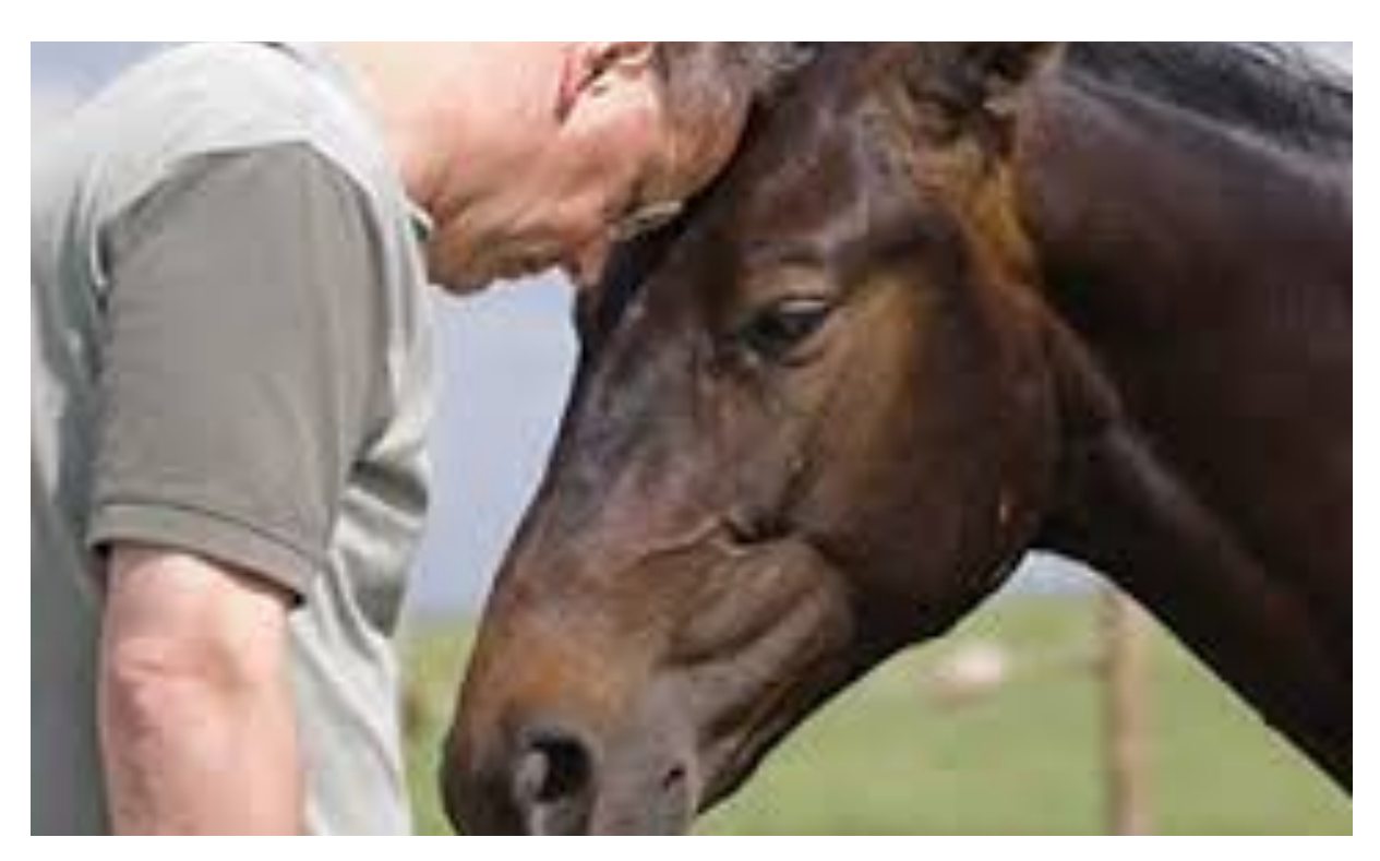
We can't always explain what we feel....

We look forward to connecting with your family.