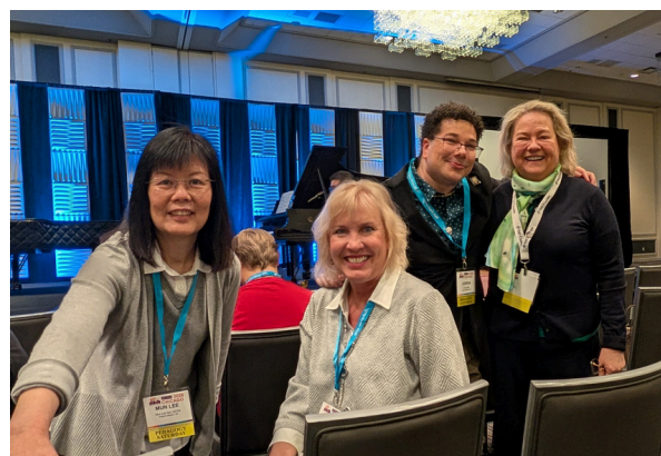
TMTF at the opening ceremony.