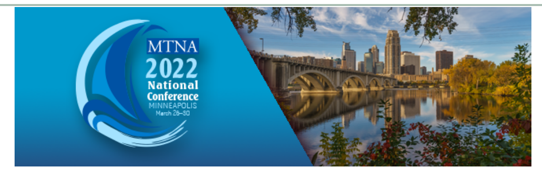
UPDATE ON 2022 MTNA NATIONAL CONFERENCE IN MINNEAPOLIS

On Monday, January 17, the MTNA Board of Directors made the very difficult decision that the inperson 2022 MTNA National Conference, scheduled to be held in Minneapolis March 26–30, will not take place as planned. Instead, MTNA will pivot to a virtual-only conference to be held on the same dates.