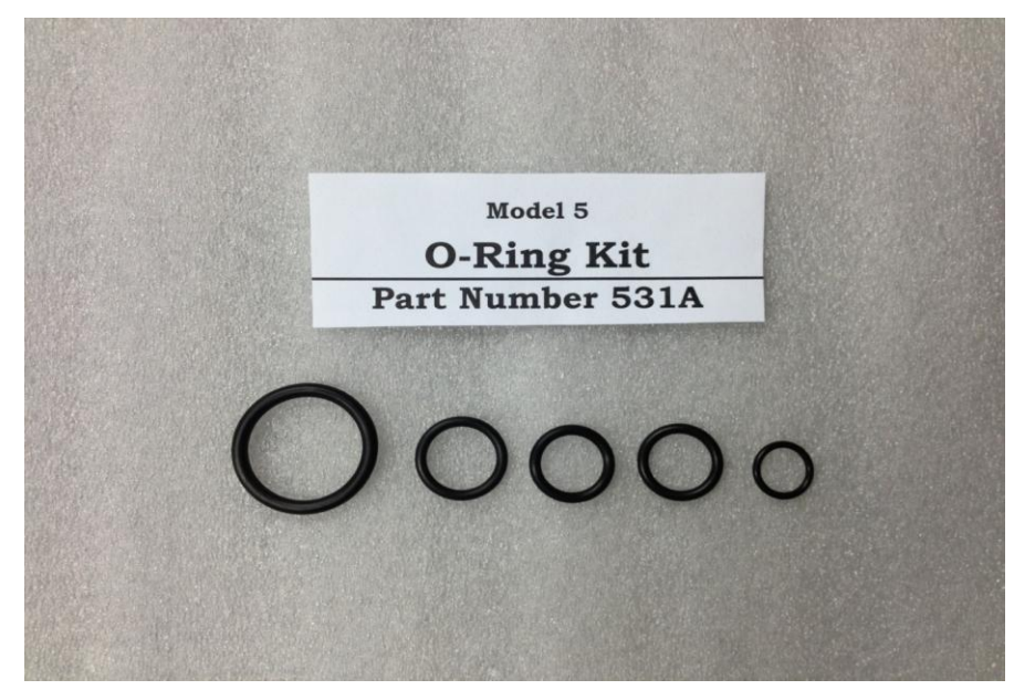
Note: A design change in January, 2014 added an O-ring for the Sealing Washer and an O-ring for the Piston Rod. The O-ring Kit now consists of 5 O-rings.