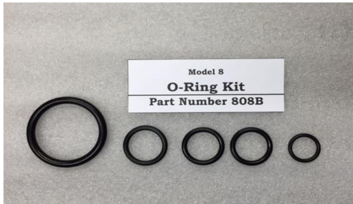
Note: The original design of the 8" Valve used an O-ring to seal the threaded end of the rod against the nut. This was used on all 8" Valves up to, but not including, Serial Number 3425.

A design change was made in August of 2008 that added an extra internal O-ring groove to the Valve Body on the nut end. This eliminated the need for the Nut Seal O-ring, and replaced it with a second Body Seal O-ring. This applies to all 8" Valves with a Serial Number of 3425 or greater.