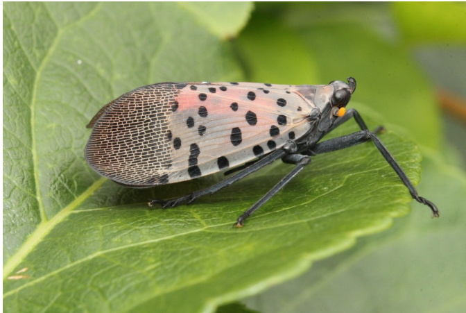
Adult Spotted Lanternfly - Side-view The side-view of a spotted lanternfly adult.