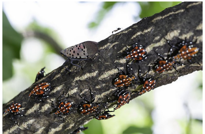
Late Stage Nymphs and Adult Spotted Lanternfly A group of the late stage 4th instar nymphs, and an adult.