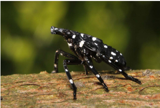
Early Stage Nymph of Spotted Lanternfly An early stage nymph (1st-3rd instars). These hatch from the eggs and are just a few millimeters in length. As they age, they grow to be ~1/4 inch long. They have black bodies and legs, and are covered in bright white spots. They are strong jumpers, and will jump when prodded or frightened.