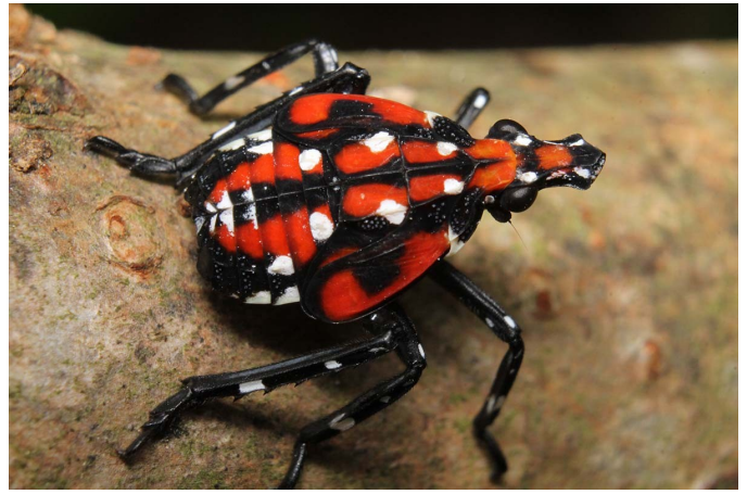
Late Stage Nymph of Spotted Lanternfly A late stage nymph (4th instars). These are the last nymph stage before becoming adults. They are ~1/2 inch long, and are bright red, covered in black stripes and white spots. They are strong jumpers, and will jump when prodded or frightened.