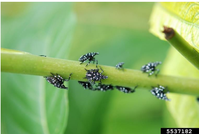
Early Stage Nymphs of Spotted Lanternfly Feeding Several early stage nymphs feeding on a tree-of-heaven. Early instars tend to feed on the new growth of a plant, such as the stems and foliage.