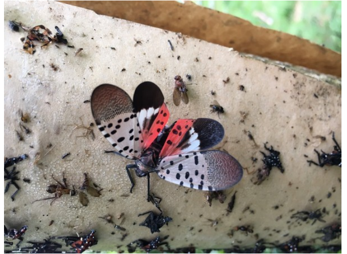
Adult Spotted Lanternfly- Open-wings An adult spotted lanternfly with its wings open. While spotted lanternfly adults can fly, they often prefer to jump and glide. You will see their wings when they are flying and gliding. You may also see them when they are frightened, or when they have been poisoned with an insecticide.