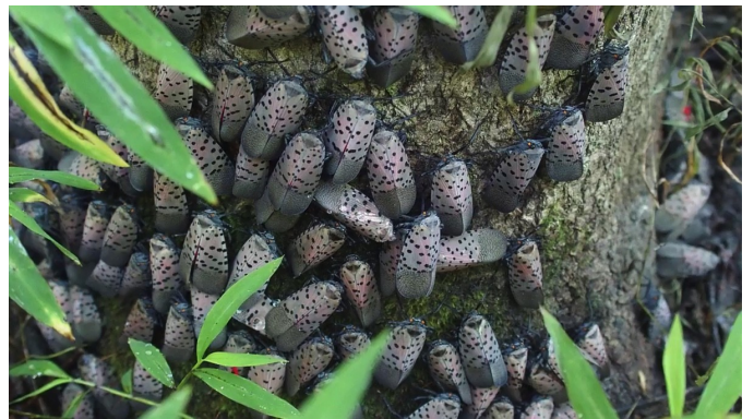
Adult Spotted Lanternfly - Group feeding A large group of spotted lanternfly adults, feeding at the base of a tree.