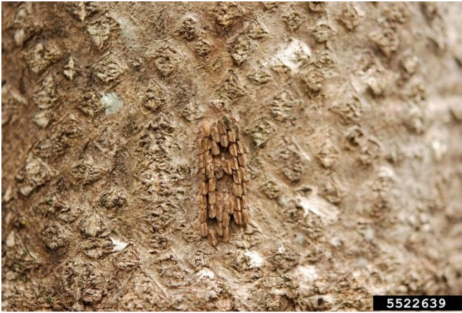
Spotted Lanternfly Egg Masses - Old Old egg masses, which have the putty or mud-like covering worn off. Here, you can see each individual seed-like egg.