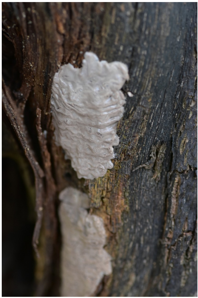
Spotted Lanternfly Egg Masses - Fresh Freshly laid egg masses, which are about 1" long and laid on hard surfaces, including trees, stones, patio furniture, etc. The egg masses are covered in a white putty-like substance, which age over time to look like cracked mud.

Life Stages of Spotted Lanternfly All life stages of the spotted lanternfly, from egg to adult.