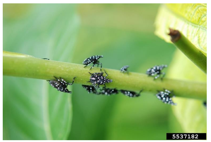
Early Stage Nymphs of Spotted Lanternfly Feeding Several early stage nymphs feeding on a tree-of-heaven. Early instars tend to feed on the new growth of a plant, such as the stems and foliage.