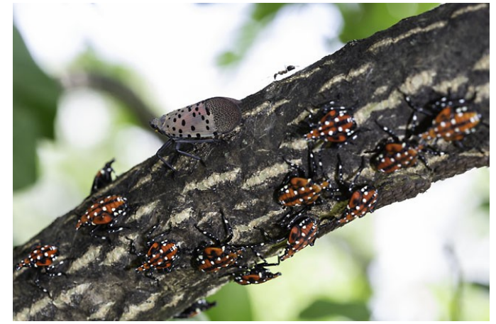
Late Stage Nymphs and Adult Spotted Lanternfly A group of the late stage 4th instar nymphs, and an adult.