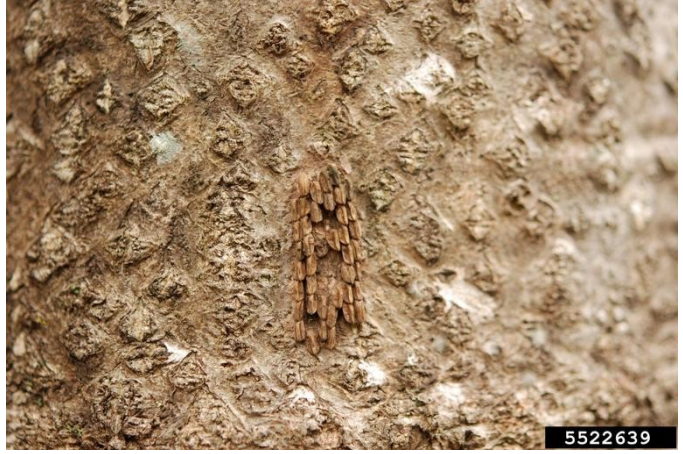
Spotted Lanternfly Egg Masses - Old Old egg masses, which have the putty or mud-like covering worn off. Here, you can see each individual seed-like egg.