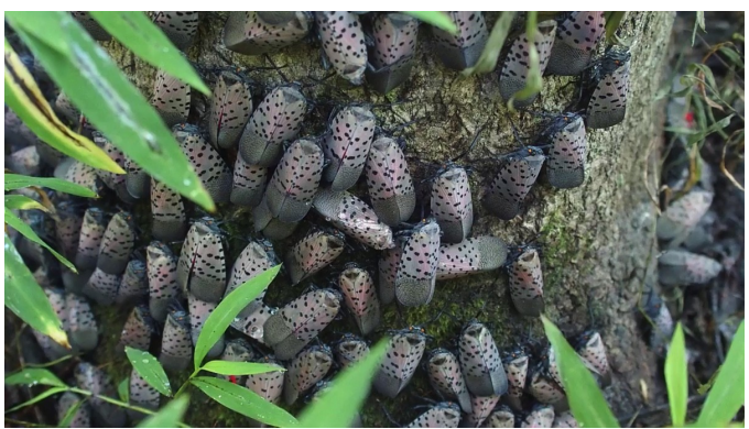
Adult Spotted Lanternfly - Group feeding A large group of spotted lanternfly adults, feeding at the base of a tree.