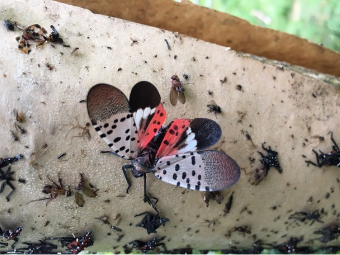
Adult Spotted Lanternfly- Open-wings An adult spotted lanternfly with its wings open. While spotted lanternfly adults can fly, they often prefer to jump and glide. You will see their wings when they are flying and gliding. You may also see them when they are frightened, or when they have been poisoned with an insecticide.