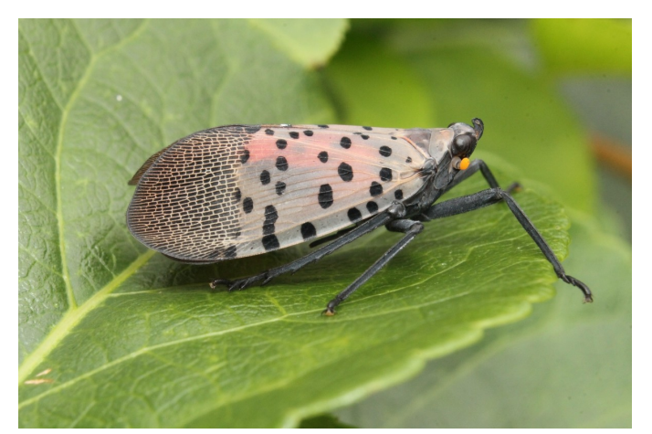
Adult Spotted Lanternfly - Side-view The side-view of a spotted lanternfly adult.

Adult Spotted Lanternfly - Top-view The top-view of a spotted lanternfly adult. Adults are about 1" long. The females tend to be slightly larger than the males.