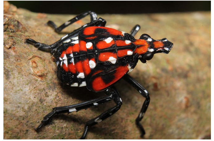
Late Stage Nymph of Spotted Lanternfly A late stage nymph (4th instars). These are the last nymph stage before becoming adults. They are ~1/2 inch long, and are bright red, covered in black stripes and white spots. They are strong jumpers, and will jump when prodded or frightened.