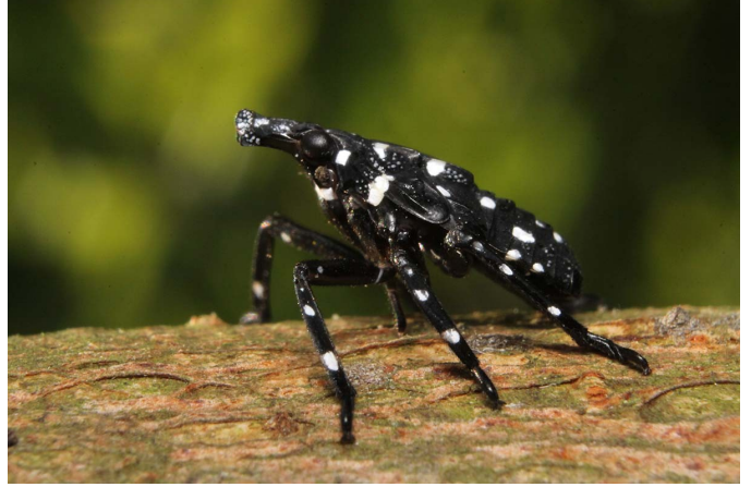
Early Stage Nymph of Spotted Lanternfly An early stage nymph (1st-3rd instars). These hatch from the eggs and are just a few millimeters in length. As they age, they grow to be ~1/4 inch long. The have black bodies and legs, and are covered in bright white spots. They are strong jumpers, and will jump when prodded or frightened.