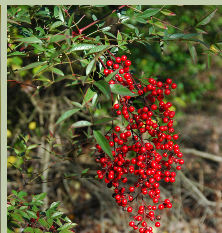
Heavenly Bamboo (Nandina)