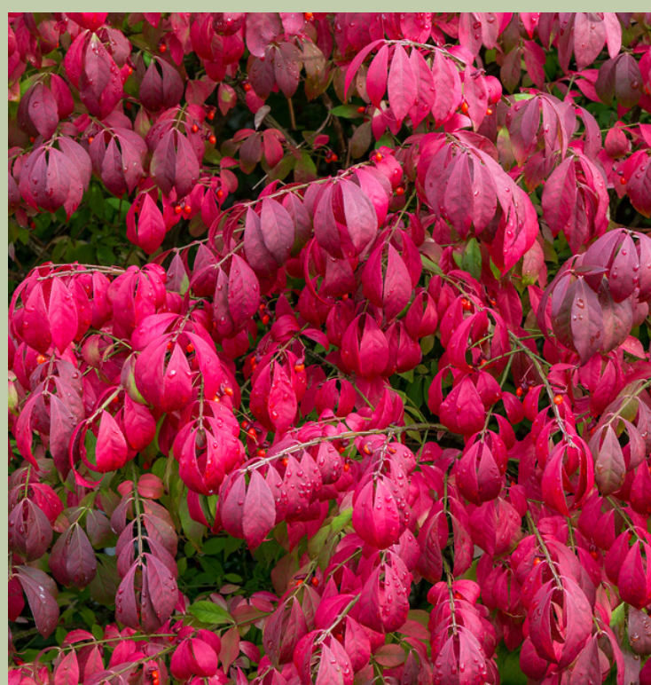
Burning Bush (Winged Euonymus)