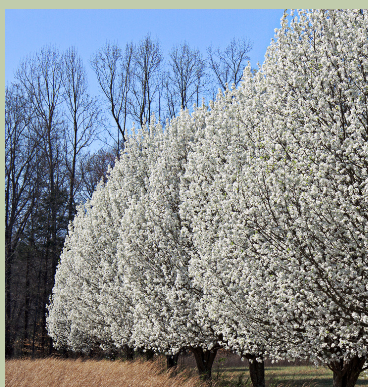
Callery Pear (Bradford Pear)