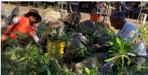
Weeding and Weed-whacking