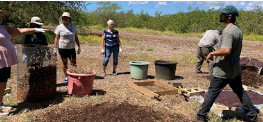
Hands-on Composting Work Group