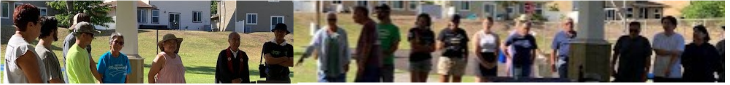
Welcome Introductions (Ho'olauna)