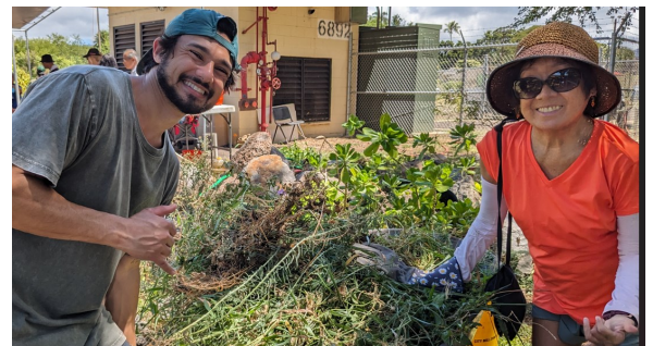
And Just Posing