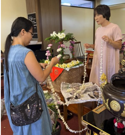
Decorating the Hanamido