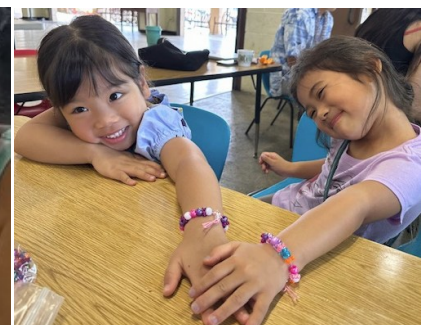
Dharma-Fun Activity - Making Bracelets