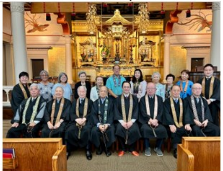
November 12, 2025 – Retired Ministers and Spouses Appreciation Gathering