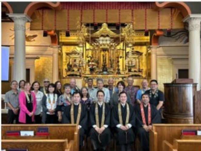
October 25, 2025 – Minister's Lay Assistant Retreat