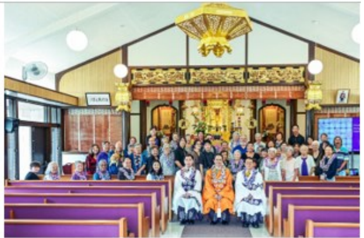
November 2, 2025 – Lihue Hongwanji Mission 125 th Anniversary