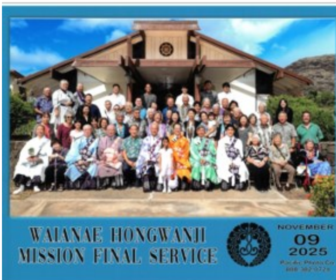
November 9, 2025 – Waianae Hongwanji Mission Final Service