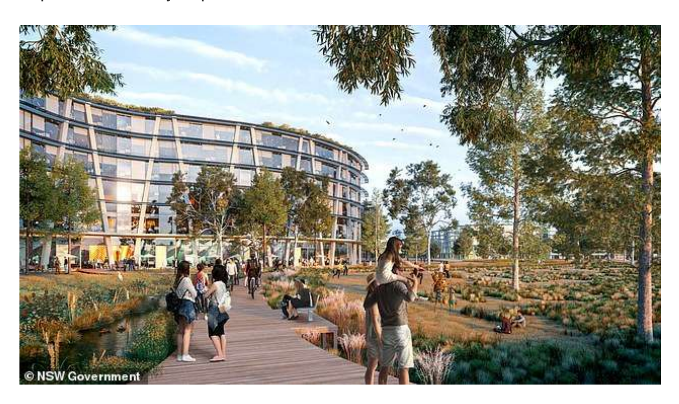
The new airport in Sydney's south-west will be the surrounded by a 'parkland city'. Pictured is an artist impression for the Western Parkland City

A battle is looming similar to the one portrayed in the 1990s Australian film classic The Castle, where the Kerrigan family overcome the odds and win the fight to keep their suburban home after developers try to acquire the land to expand the nearby airport.