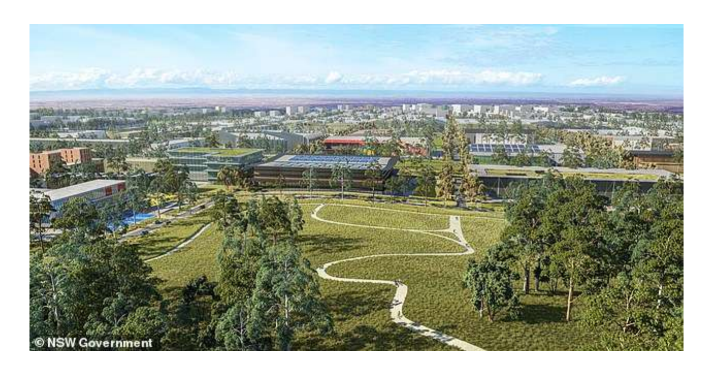
The NSW government recently released a more details vision for the new Western Sydney Aerotropolis (pictured)