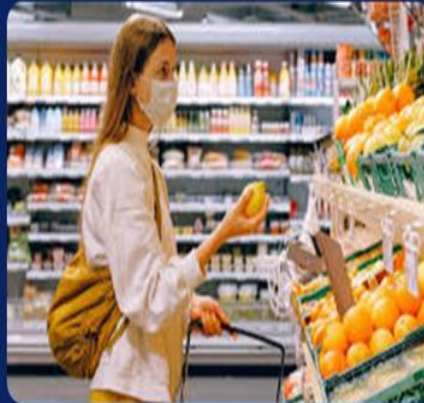
Best Customer Experience