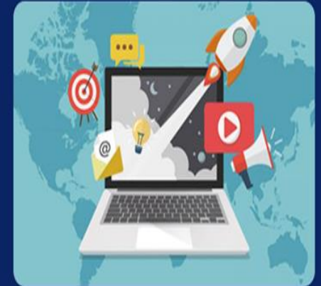
Digital Marketing Expertise