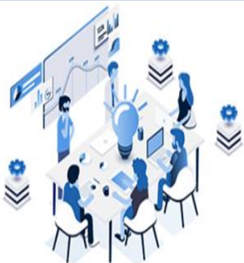
Training & Business Advice