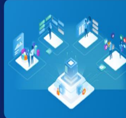
Control Over Governance