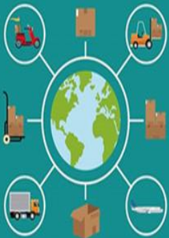
Control Over Supply Chain