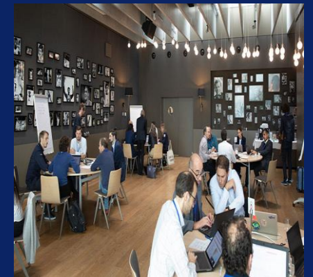
Lead By Retail Experts