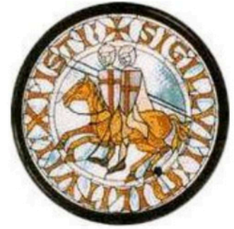
Knight Templar Seal

‘Ulama or ‘Alim: A scholar, specifically in religious subjects. The term ‘ulama is used to describe the class of professional men of religious learning who form the nearest Muslim entity to a clergy.