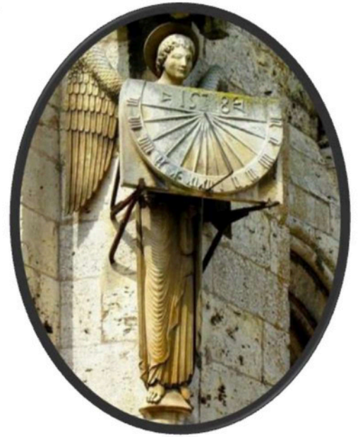
This sculpture on the side of Chartres Cathedral shows an angel carrying a sundial, a device used to tell time during the Middle Ages.