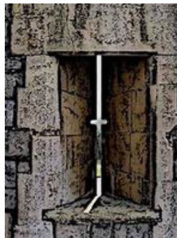
Arrow Loop Inside View