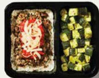
I. ITALIAN GROUND BEEF & MARINARA BOWL