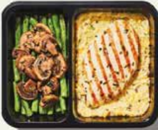
A. CHIVE & GARLIC CHICKEN