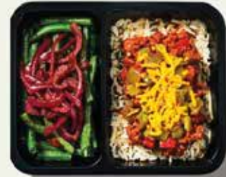
C. STUFFED PEPPER CASSEROLE