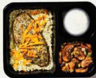
H. KETO RANCH CHICKEN