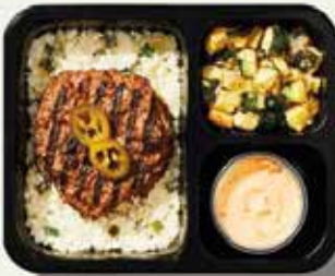
D. JALAPENO POPPER BURGER