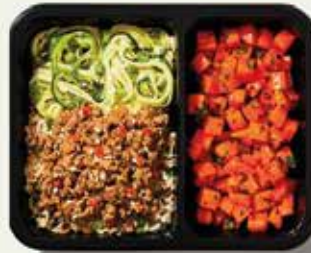
E. SWEET LEMONGRASS BEEF