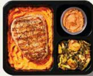
B. APPLE MUSTARD PORK CHOP