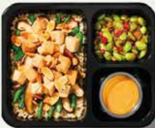
G. SMOKED TOFU ALMOND STIR-FRY