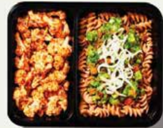
F. ROASTED VEGETABLE FUSILLI