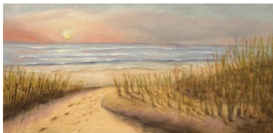
Brown, Grab Our Spot