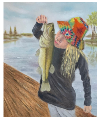
Brown, Catch, Kiss and Release