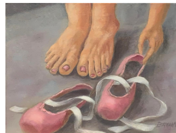
Brown, Just Before Curtain