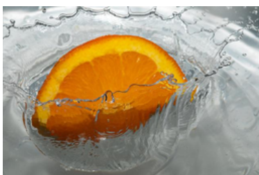
O'Donnell, Orange Splash