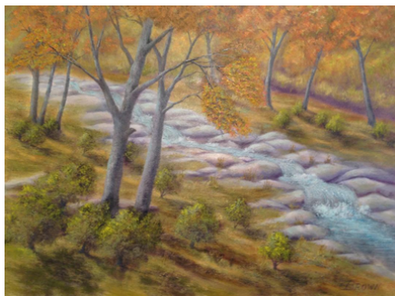
Brown, In the Flow