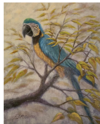
Brown, Blue Macaw