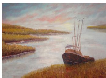
Brown, All but Forgotten