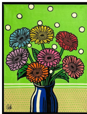
Pratt, Daisies are the Friendliest Flower

BJ Elvgren's charming Flight of Fancy and Elena Pratt's Daisies are the Friendliest Flower are also included in the exhibition.