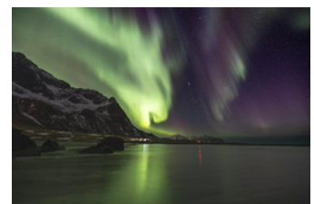
O'Donnell, Skagsand Beach Monster