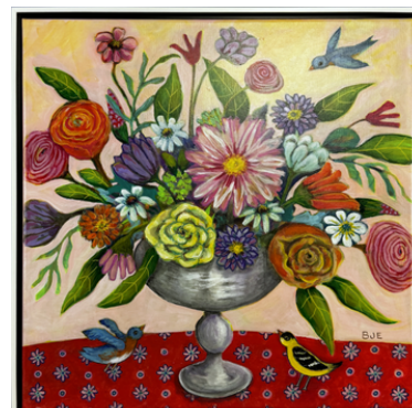
Elvgren, Flight of Fancy