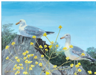
McClusky, Ginny, Rest Stop

Jen Heinz has certainly shown us the extraordinary with her photo Blooming Magnolia . Jen describes how she created this image. “ Blooming Magnolia attempts to capture the beauty of a magnolia branch that had naturally broken from the tree at the height of its bloom. To create the image, I placed the branch on a large light panel and photographed it from directly above—using a wide-angle lens and a step stool to frame it just right. I like the minimalist composition options that using a light panel provides. In this case, allowing the viewer to focus solely on the curve of the branch and delicate blooms without any distracting background. In post-processing, I deliberately softened the textures and refined tones to create the painterly effect.” Extraordinary indeed, Jen!