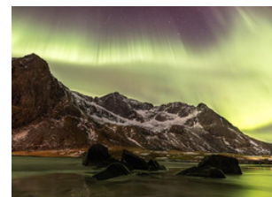
O'Donnell, Light Rocks