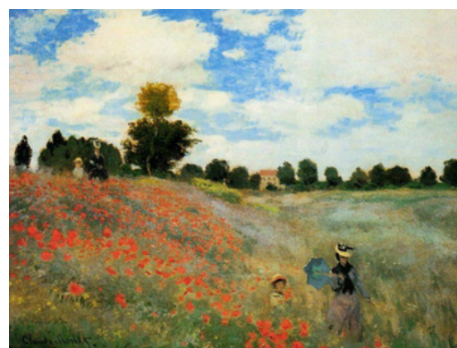
The Poppy Field near Argenteuil, Claude Monet

Monet captured a lovely summer day near Argenteuil in the painting at right. If you will remember, Vincent Van Gogh also spent time painting in Argenteuil along with artists Albert Sisley, Edouard Manet, Gustave Caillebotte and Pierre-Auguste Renoir. It must be a beautiful place!