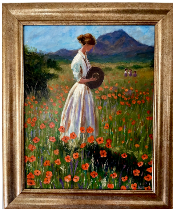
Field of Poppies, Bill Mann

The exhibition is on display June 6, 2025 through June 29, 2025 at LibertyTown Arts Workshop. It is located at 916 Liberty Street Fredericksburg, VA. Hours are Monday through Saturday 10 am to 8 pm and Sunday 10 am to 6 pm.