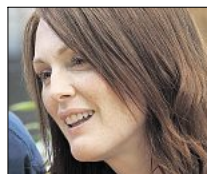
Moore: A mom in The Kids Are All Right .