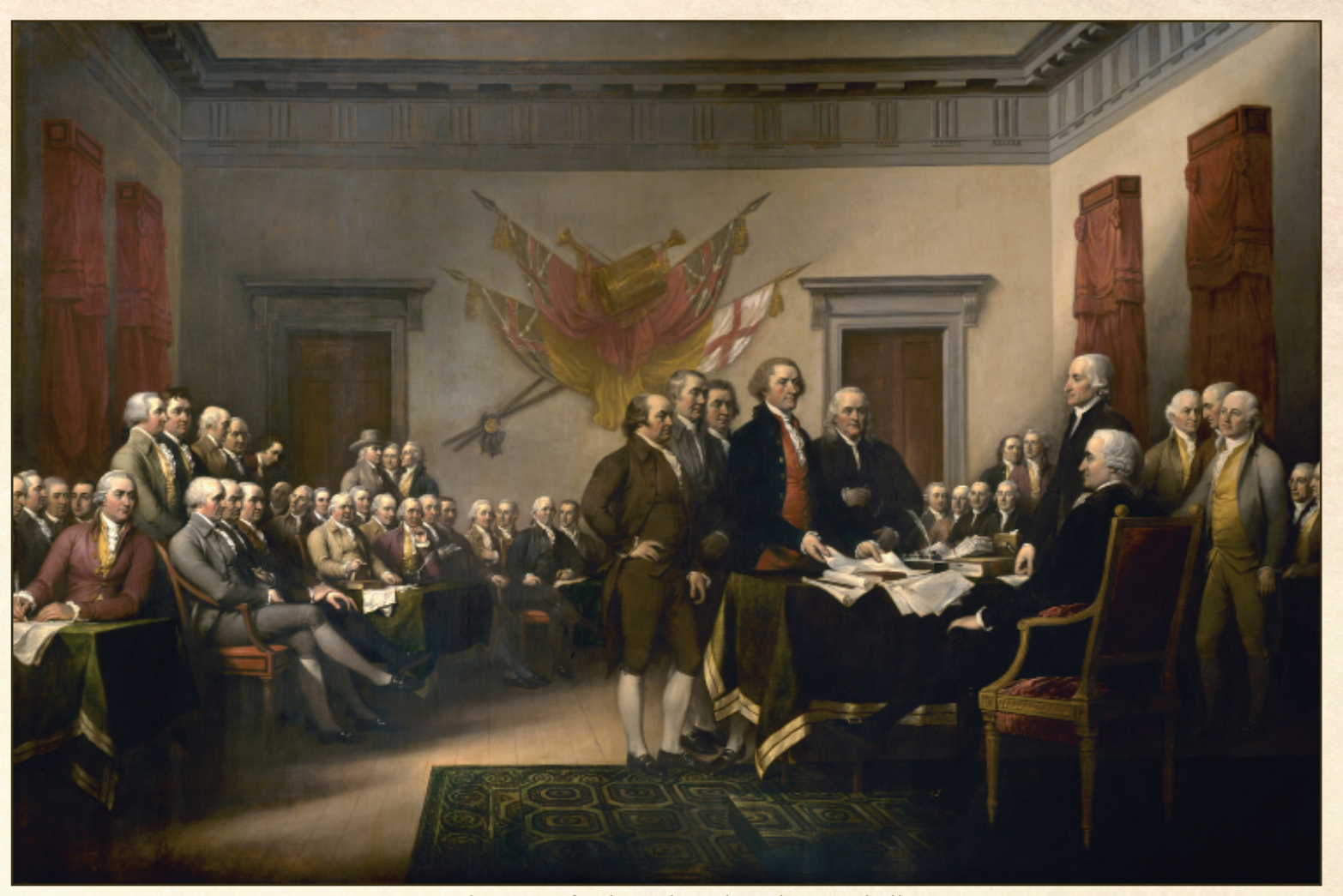
Declaration of Independence by John Trumbull Reproduction featured in Glen Allen Branch Library's new Founding Fathers Collection.

The Founding Documents of the United States of America in honor of the Glen Allen Branch Library Founding Fathers Collection