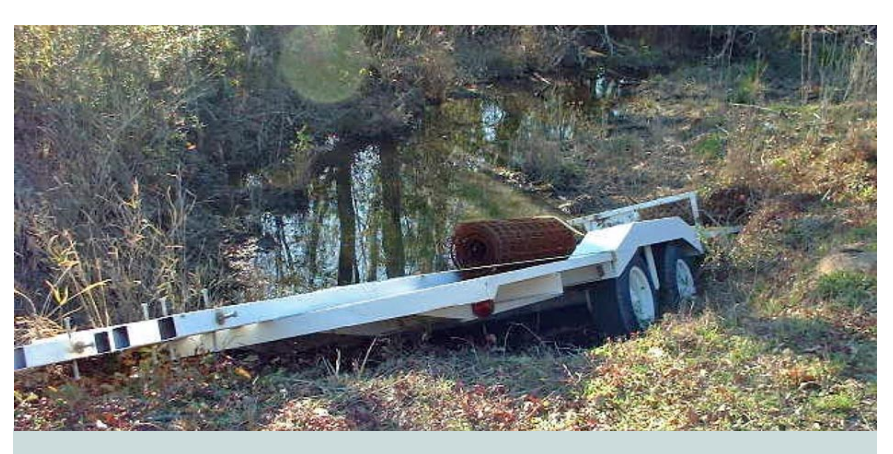
Figure 3-1. Trailer near stream post-accident

On March 2, 2005, at the Savannah River Site, subcontractors were relocating a flatbed trailer onsite when the trailer hitch detached from the truck. The trailer veered to the opposite side of the road, went down an embankment, and came to rest in a nearby stream (see Figure 3-1). No other vehicles were involved in the incident, no one was injured, and there was no damage to either the truck or the trailer. However, the trailer crossed into the path of an oncoming car that was about 100 yards away, creating the potential for a serious accident. (SR-WSRC-CMD-2005-0002; final report issued April 20, 2005)