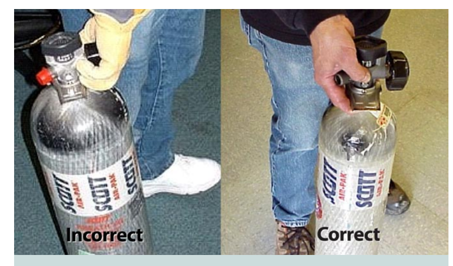
Figure 1-1. The incorrect and correct method for handling an SCBA cylinder

The facility safely handles upwards of 50 cylinders a day and has never had a mishap like this one. The rigger's handling of the cylinder was careless and could have resulted in worker injury. Safe handling of SCBA cylinders should include using cylinder storage racks to protect the cylinders from casual damage and thread protectors to prevent damage to the valve threads and to keep foreign materials from entering the valve orifices.