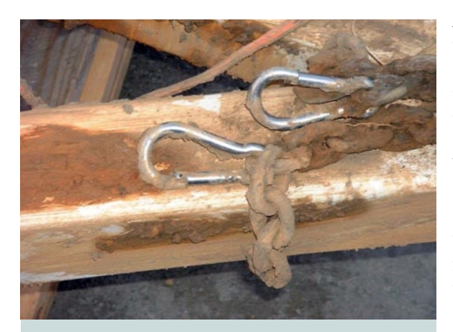
Figure 3-3. Post-accident photo showing unattached safety chains

retain the connection when the trailer coupling separated, but photos taken after the incident show that they were never attached between the truck and the trailer (Figure 3-3).