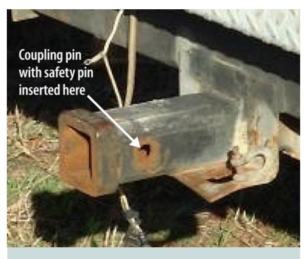
Figure 3-2. Trailer hitch assembly

On the day after the incident, critique members learned that the truck had hauled approximately six trailers during the week in which the incident occurred. The same hitch assembly was used in each case—a trailer hitch with a cotter pin and a safety pin (Figure 3-2).