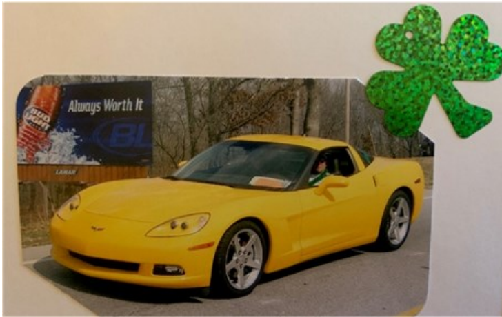
The Club's first C6 Z06 owned by Wally Cunningham.

In 2006, five cars from LOCC participated in the St Patrick's Day parade.