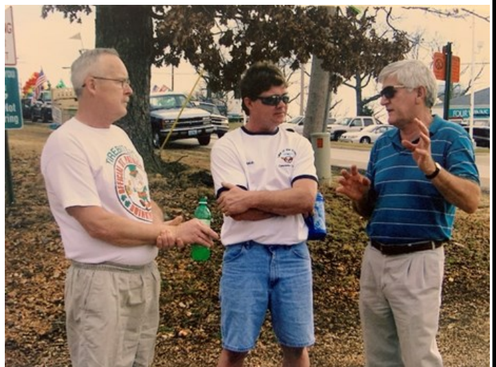
The guys talking "smart" getting ready for the parade.