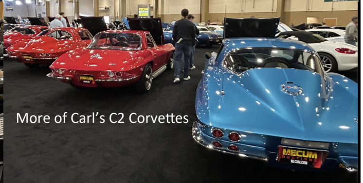
More of Carl's C2 Corvettes