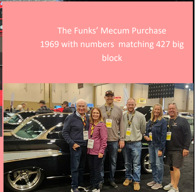
The Funks' Mecum Purchase 1969 with numbers matching 427 big block