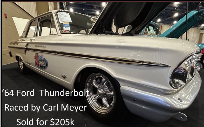
'64 Ford Thunderbolt Raced by Carl Meyer Sold for $205k