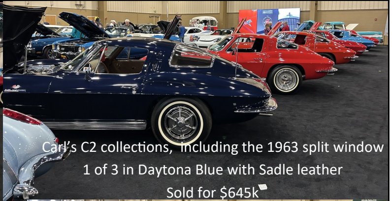
Carl's C2 collections, including the 1963 split window 1 of 3 in Daytona Blue with Saddle leather Sold for $645k