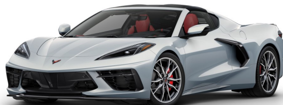
Not Actual Color

Price: $150.00 Tickets: 1500 Drawing: August 14, 2025 2:00 PM Central Time