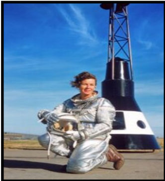
Betty Skelton, 2001 Corvette Hall of Fame Inductee

Betty Skelton (Frankman), frequently referred to as the “first lady of firsts”, worked side-by-side with some of the biggest names in Corvette, and established unbelievable records of her own in racing, aviation and automotive history. The first woman to be inducted into the Corvette Hall of Fame was also the first woman in the world to drive racing cars to new records through the famous NASCAR measured mile on the sands of Daytona Beach. Skelton established records for Chevrolet behind the wheel of the Corvette, and appeared at major auto shows, as well as national ads and TV commercials.