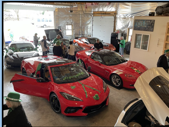
Many Thanks to the Ehlman's for allowing us to stage for the Parade at the Rock Solid garage!