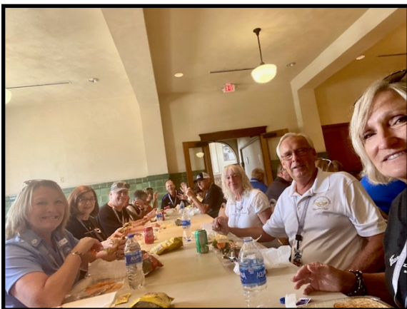
Lunch in the old Train Station in Bowling Green