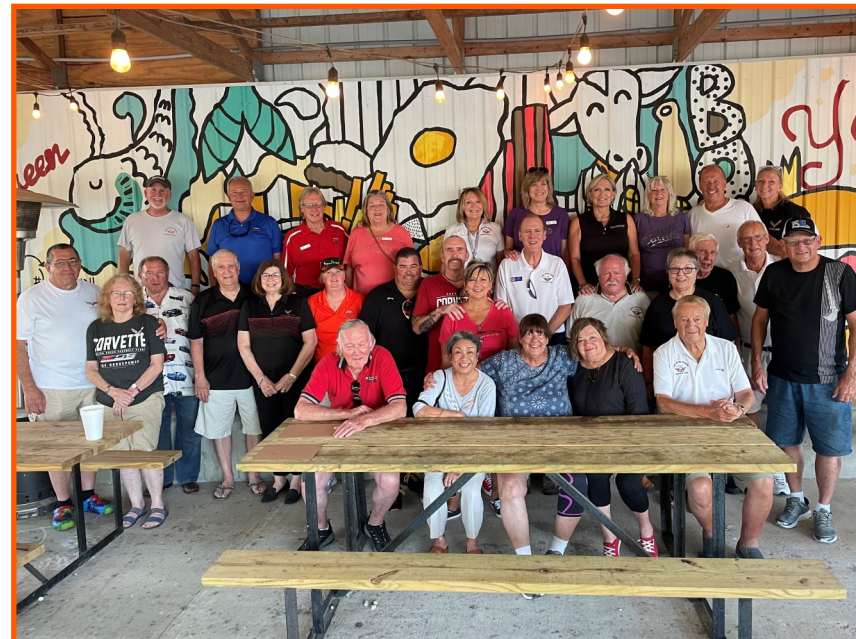
The entire Bowling Green group is pictured in front of the graffiti wall outside of the Boyce General Store after dinner. If you google, The Pie Queen, the owner ships her delicious bakery items nationwide, and they are delish!