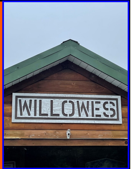
Corvettes in Paradise Sponsor

The July meeting was held at Willowes in Linn Creek with 59 Club members in attendance and 14 Corvettes parked outside.