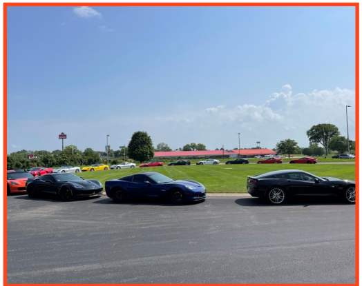
LOCC cars on circle outside the museum on Thursday.