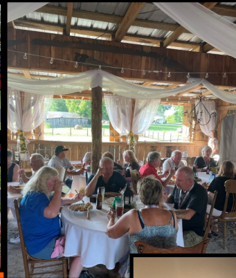
(Left) LOCC was welcomed at Mammaw's Kitchen & Bar for outdoor dining, some live entertainment and even some bags being thrown.