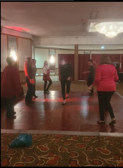
The Dance Floor Divas!