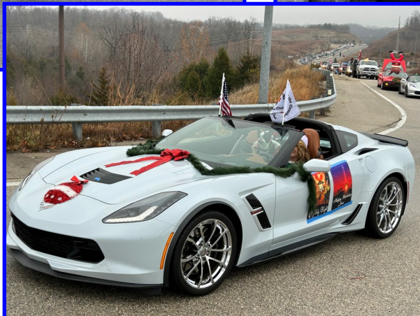
Top Left: The group meets in the drizzle to discuss the short drive to the line up destination. Top Right: Corvettes line up to decorate. Center, Left to Right: The Horsman car, the Myers with their red sled and Keith Mellen in the Stingray R. Bottom Left: Ellen and Winston are ready to show off the Grand Sport on the Strip.