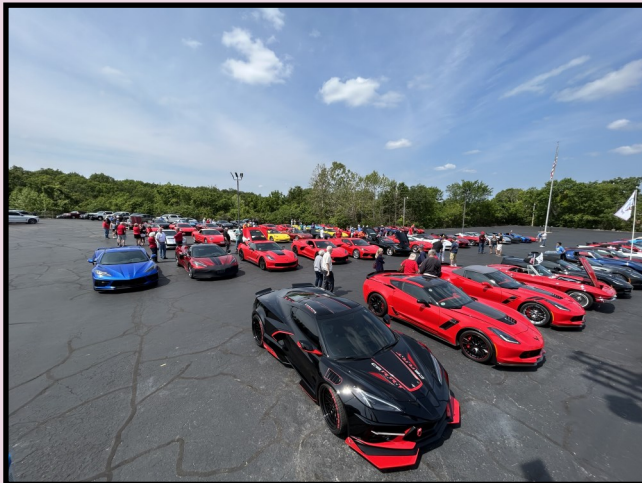
Another shot from Hulett Chevrolet May 21st