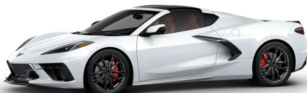
2024 Arctic White Corvette Coupe

6/13/2024 Price: $100.00 Tickets: 2000 Available: 1752 on 04/22/2024