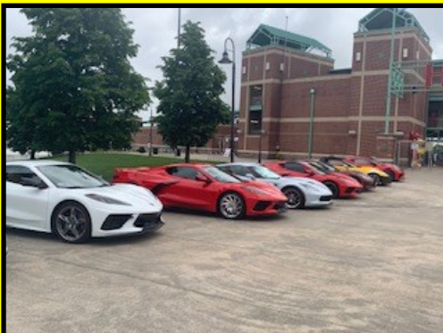
LOCC outside of Hammons Field