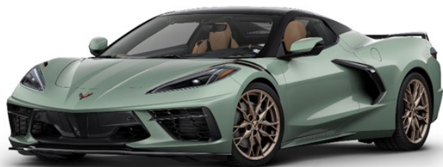
2024 Build Your Own Corvette

6/13/2024 Price: $100.00 Tickets: 2000 Available: 1752 on 04/22/2024