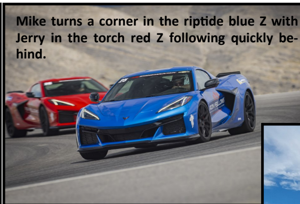
Mike turns a corner in the riptide blue Z with Jerry in the torch red Z following quickly behind.