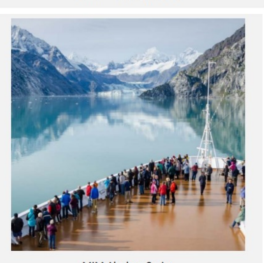
MiM Alaskan Cruise July 11th - July 23rd, 2023