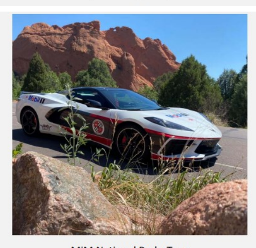
MiM National Parks Tour September 24th - September 30th, 2023