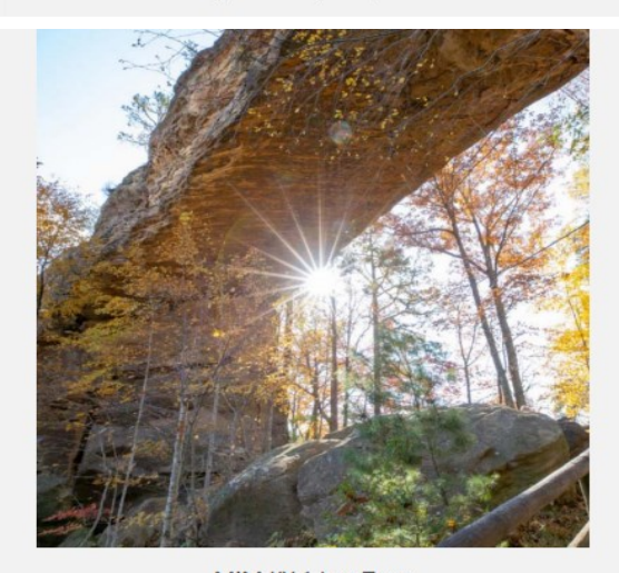
MiM KY 1 Lap Tour Week 1: September 25th - 30th, 2023 Week 2: October 2nd - 7th, 2023 Week 3: October 9th - 14th, 2023