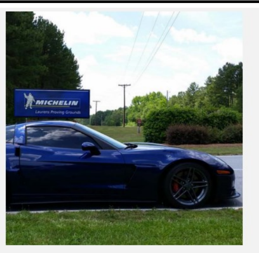
MIM Charlotte Experience Jun 4<sup>th</sup> – June 8<sup>th</sup>, 2023