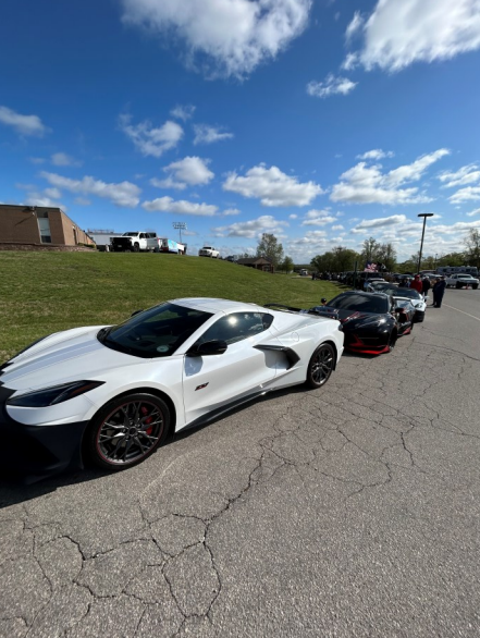
MAY 2023 ~ Volume 23 ~ Issue No. 4