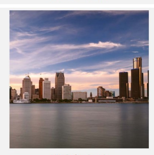
MiM Explore Detroit July 9th - July 13th, 2023