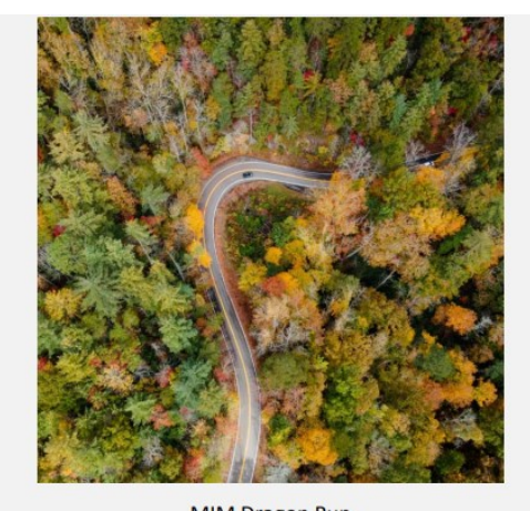
MIM Dragon Run April 30<sup>th</sup> – May 3<sup>rd</sup>, 2023

Here are some coming up in the next few months.