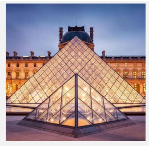
MIM Le Mans Tour June 3<sup>rd</sup>- Jun 13<sup>th,</sup> 2023