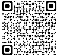
HS Show Winners