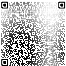
Drive of Terror