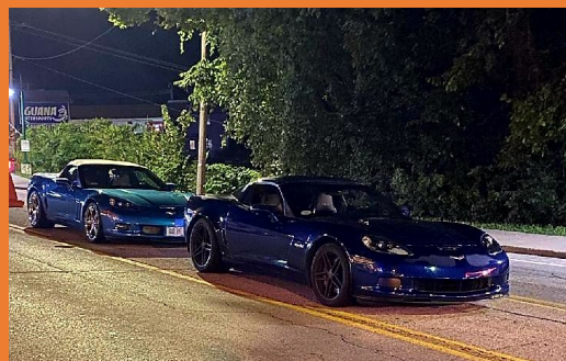
The last 2 Corvettes at the Magic Dragon