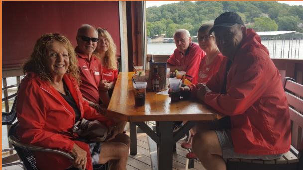
I think they "red" the memo! :)