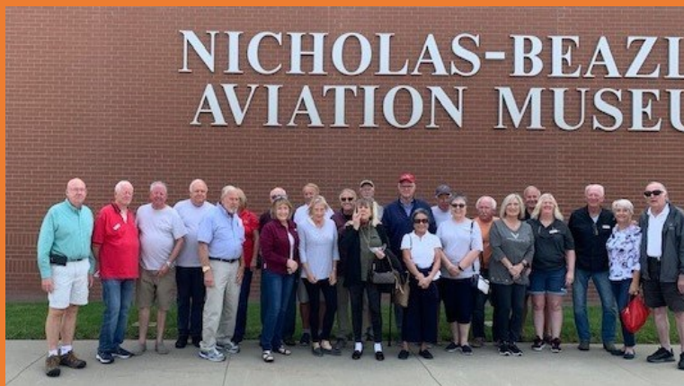
What a good looking group!