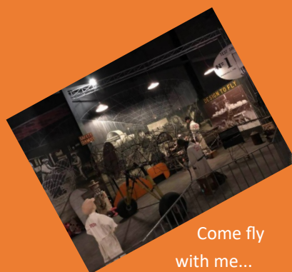
Come fly with me...