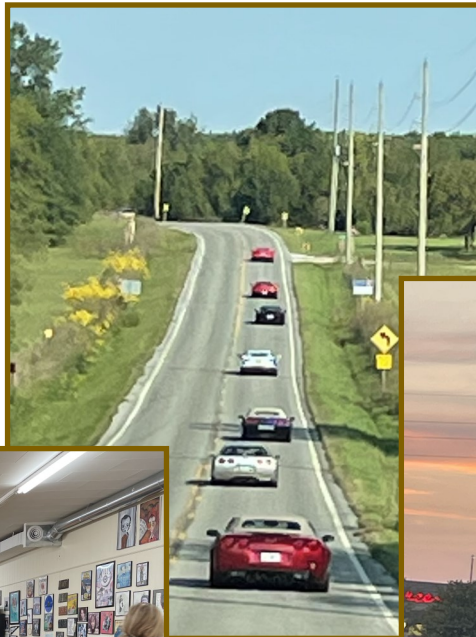
Middle: Vette caravan headed to IA with black eyed susans lining the roadways Left: LOCC cars at Karl Chevrolet Below left: Dining at Boji Café Below: The large flag at half mast at Karl Chevrolet for the Hot Summer Nights Drive-In