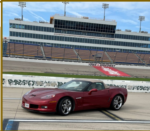
Far left: A great shot of Gary Cooper's Z06 outside the speedway