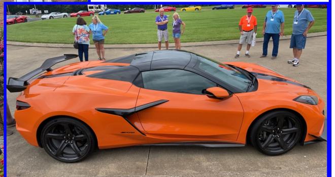
The orange Z06 appeared outside the museum while the group was touring. Complete with the carbon fiber wheels, what a treat for the group to see!