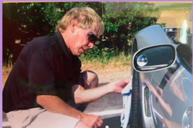
Who's that shining up his wheels?