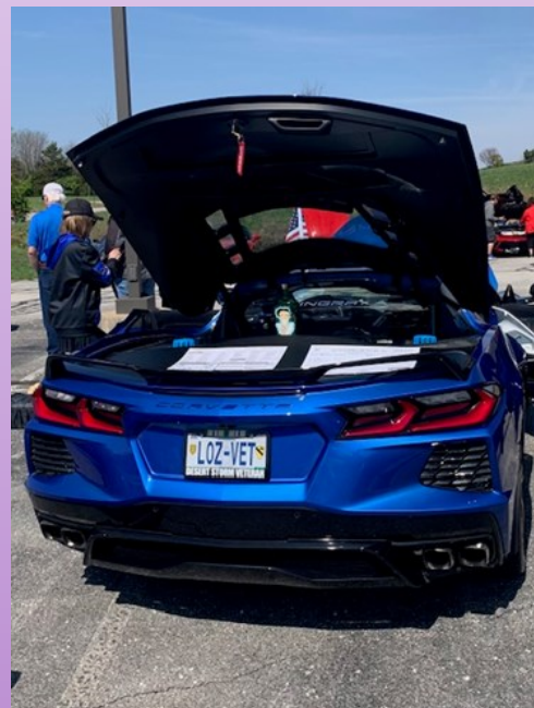
Don & Zoe 1 st Place in the Silent Auction/Don Dettman – 3 rd Place 2020 through 2024 C8