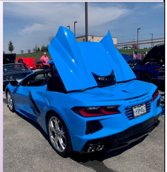
Ed Tostenrud – 1 st Place 2020 through 2024 C8 Convertible