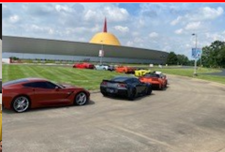
Zora Duntov's Corvette is seen off frame in the background