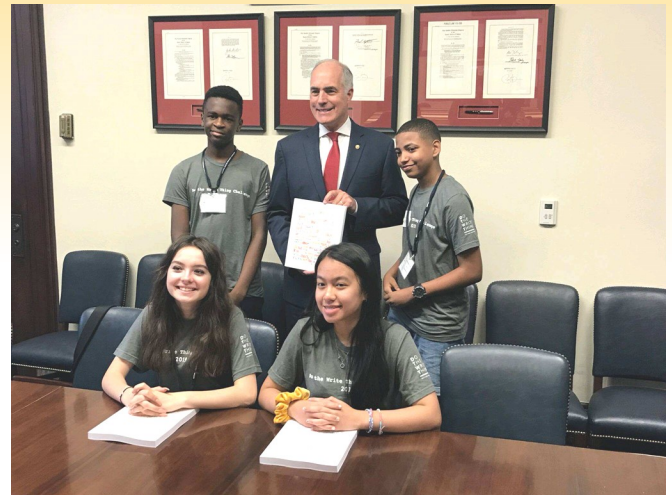
Pittsburgh and Philadelphia DtWT Ambassadors present book of their writings to Pennsylvania Senator Bob Casey.

A thorough reading, review and ranking of all the student writings was conducted by volunteers from the Duquesne University School of Law , University of Pittsburgh School of Social Work , Highmark Blue Cross Blue Shield employees and CMU Delta Tau Delta Fraternity to arrive at the best writings from each school based on the content of the writing. Ten finalists were then selected by notable Pittsburghers (see Black & Gold Committee below).