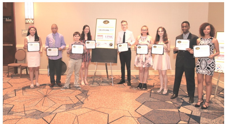
DtWT Top 10 Finalists