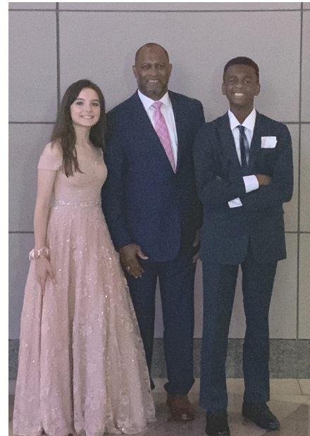
Dinner at Ronald Reagan Center in Washington DC