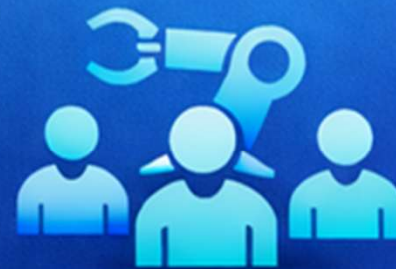
Digital Workforce Extender