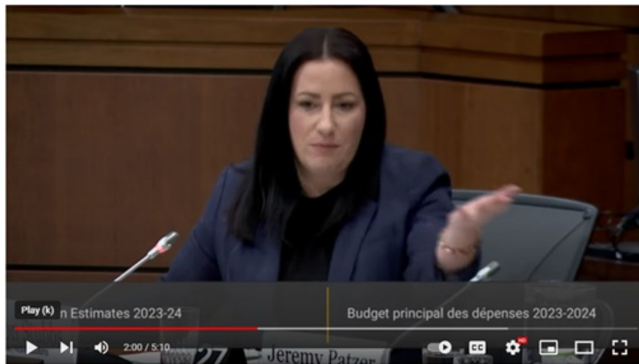
The NDP-Liberals' Anti-Energy Policies Are Holding Canada Back Click on the image above to view the exchange on YouTube

As far as he's concerned, it's a mark of success for one project to clear the approval process in three years. Never mind actually getting it built. That's what he told my colleague MP Shannon Stubbs at our committee: