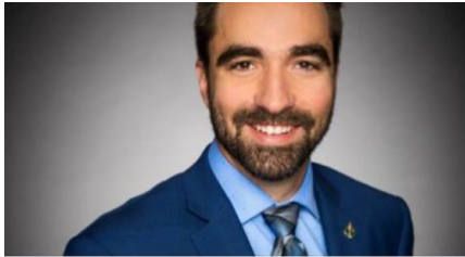
KINDERSLEYSOCIAL.CA Clare's Law Will Now Be Enforced by the RCMP - Kindersley Social - Local News, Writers, Sports, Events an...

Click the image above to read more on our work to help make the enforcement of Clare's Law in Saskatchewan possible.