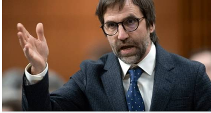
NATIONALPOST.COM Ottawa's move to regulate video posts on YouTube and social media called 'assault' on free speech

Click on the image above to read the National Post article on C-10.