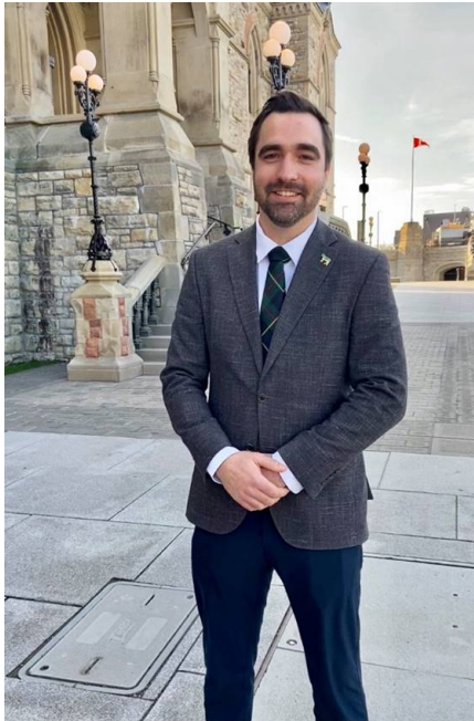
I continue to be grateful for the opportunity to represent you in Ottawa.