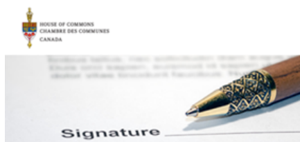
Click on the image above to sign the Petition.

Many of you have written to me regarding Bill C-21, which is driving a false narrative against law-abiding firearms owners but does nothing to target criminals, gun smuggling, or gang violence. The majority of gun crime in Canada is committed with an illegally obtained firearm, and rather than working on legislation that would target illegally obtained firearms, the Ottawa Liberals are more concerned with banning airsoft guns.