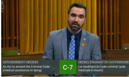
Click on the image above to view my speech on the C-7 Senate Amendments.

undermining suicide prevention initiatives and normalizing death as a solution to suffering. I am grateful for all my Conservative, NDP, and Green colleagues who recognized this and opposed the Senate amendments.