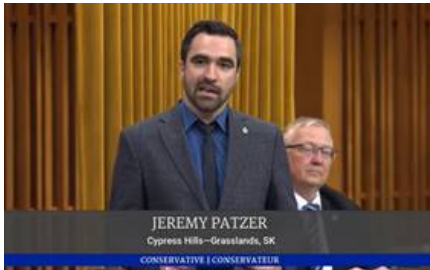
Click on the image above to view my statement on rural-urban divide.

One of the biggest divides I've noticed even more while serving as your voice in Parliament is between urban and rural Canada. A significant part of my job is serving as liaison between you, my constituents, and government officials, but I'm often shocked at how little the Ottawa bubble understands or even seeks to understand rural Canadians, and their unique needs.