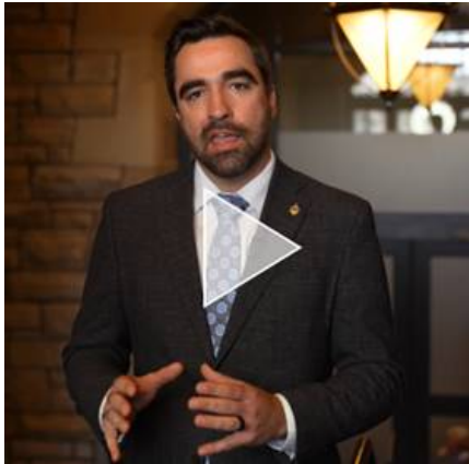
Click on the image above and see what I'm hoping to see in Budget 2021.