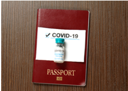
No policy on vaccine passports has been implemented in Canada yet, but the Government is currently considering different options.

Many of you have reached out this past month, asking my view on vaccine passports. While I oppose the use of vaccine passports in principle, and would not support their use in Canada, I also know that it could be a helpful way of safely restarting international travel. I would be interested in hearing what your thoughts on this issue are, so feel free to let me know by replying to this email.