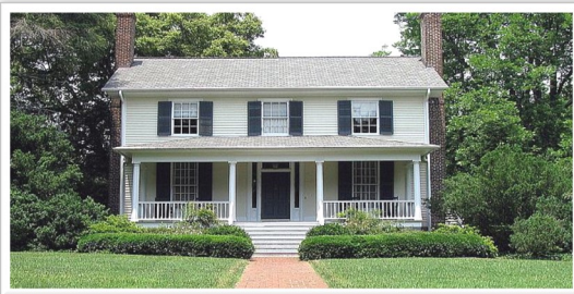
Home Ownership with No Mortgage