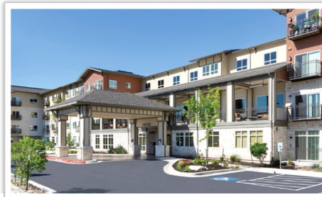
Local Senior Community Residence Non-entrance fee, similar 2 bdrm.