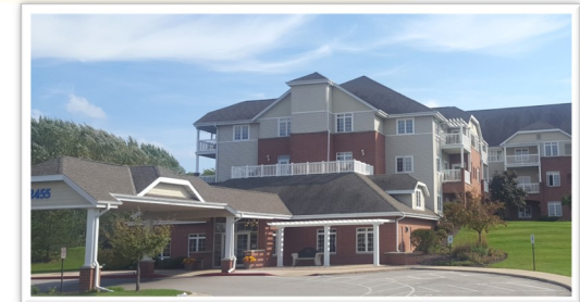
Steeple View's Popular Belmont (B Unit) Entrance fee required ($132,500)

(90% of entrance fee is refunded when you leave—see below.)