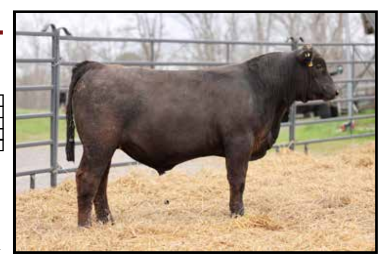
Lot #22 - BYB MR PAXTON LO2

Mr. Paxton is out of what should be a cow making machine going back to Ohlde and the Donna line of females. With an API of 141.32 puts him in the top 3% along with 8 other EPD's in the top 25%. Nice bull that should have a positive influence on your herd so help yourself.