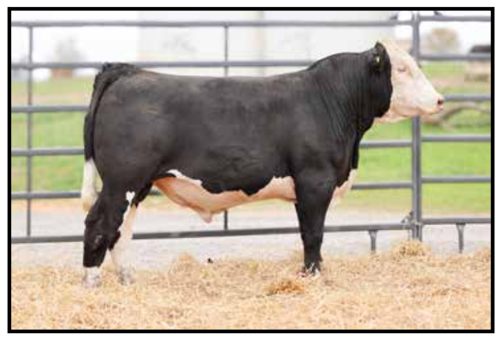
Lot #24 - C4 BIG ORDER L321