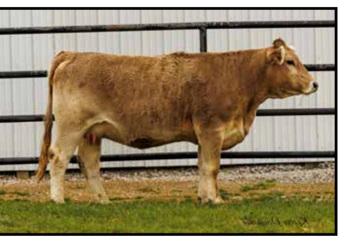
Lot 33 - MISS JMS PATRICIA K295