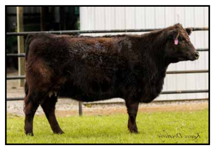
Lot 43 - MISS JMS EMMY K273

This Sim-Angus female stems from a bred heifer we purchased from Cardinal Cattle Company back in 2018 who is still doing a great job for us today. K265 is moderately designed, has a quiet demeanor, and should mature into a nice cow. She will be heavy bred or will calve before sale day to a Purebred Angus or Braunvieh bull.