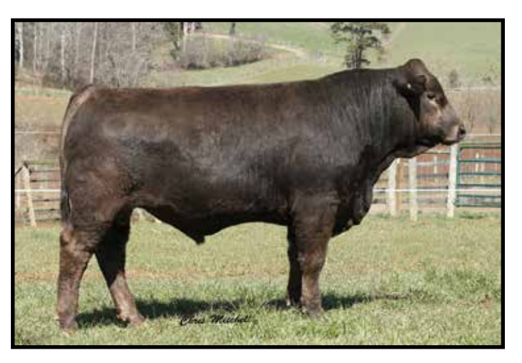
WW BS MAIN LINE 200Z - Grandsire of Lot 36