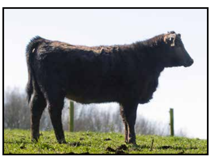
Lot 28 - WOODALL 388 7112 FNS

Sired by the popular Myers Fair-N-Square, cattlemen are liking the type and kind M39 is producing.