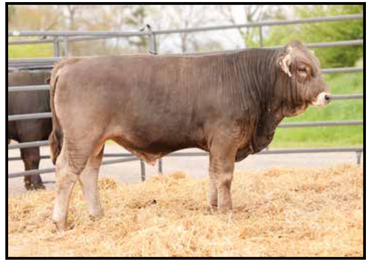
Lot #4 - WIN-V SAM MEX MIGUEL L31A ET