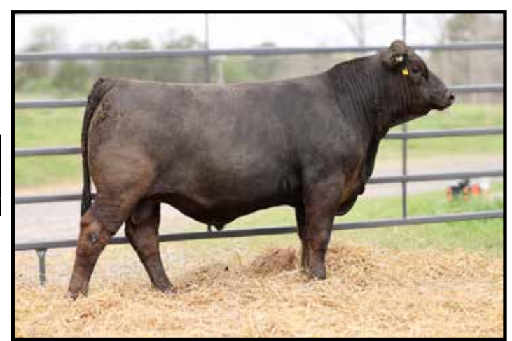
Lot #19 - BYB MR TAHOE L01

Mr. Tahoe is out of the very poplar bull Tehama Tahoe B767 and it shows. With a very impressive API of 156.90 putting him in the top 1% along with 9 other EPD's in the top 10%. Nice bull that should have a positive influence on your herd so help yourself.