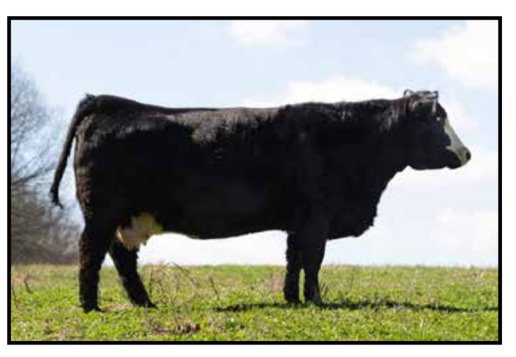
Lot 47 - RDFS 35C

Really stout easy keeping cow that stems back to the well-known SVF Sheza Star cow. If you're looking for a gentle, easy keeping, blazed faced cow, look no further. This lady produced a top selling Simangus bull in a recent Adding Value Sale. Due approximately 4-1-2024 to our Homo Black herd sire RDF 1145 (BC101224).