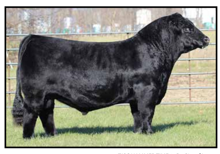
TJSC HAMMER TIME 35D - Sire of Lot 45