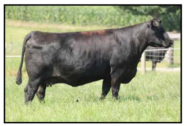
Lot 26 - YON MIGNONNE C568

C568 is out of the well known Yon Program. This female is long spined, beautiful fronted, with excellent phenotype. Pasture exposed to PJDC Teddy Bear Z10 (PB81753) from 1-10-2024 to 2-20-2024. Pregnancy status will be updated. 26A - Heifer calf at side born 11-8-2023, BW 73lb. Woodall 3190 C568 747 (AAA 20853201).