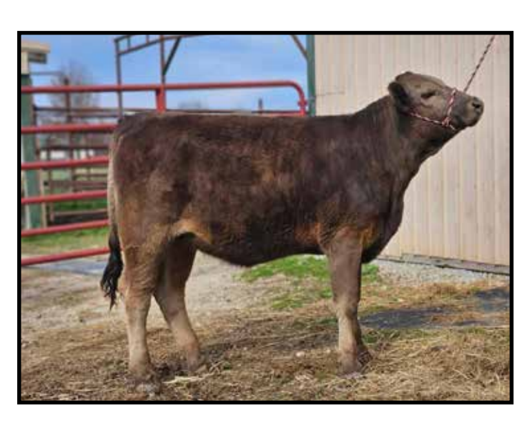
Lot 35 - SW PURE CHROME MAGNUM