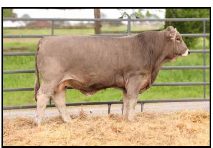
Lot #6 - WIN-V SHAKA KHAN L312 ET