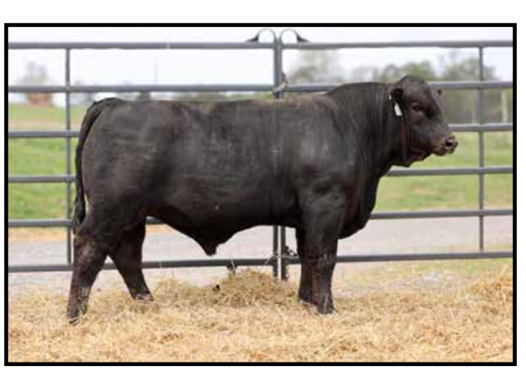
Lot #18 - RDF XEROX 1315L

Heterozygous black, homozygous polled - Xerox is a dark, black, bull with CED and BW numbers to be heifer safe. RDF 1315 has a 16.0 CED and a -0.9 BW EPD, which both rank in the top 10% of the breed. RDF Xerox also gained 4.70 ADG on test. If you're needing a sleep all night heifer bull, that's progeny won't sacrifice it on the other end, here he is! Ratio 100% (14.16) on ribeye and 104% (3.42) on IMF. TAEP Calving Ease/Maternal Qualified.