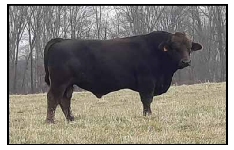
WW CORNERSTONE 814F ET - Sire of Lot 34

Sells bred to Mr. Firepower (PB101620) to calve this spring.