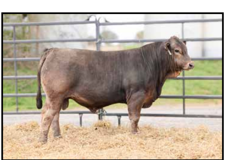
Lot #12 - RDF FIRE COUNTRY 1335L

Homozygous black, heterozygous polled, ADG 4.03. This bull will add growth, milk, maternalism, & longevity to your herd. This high percentage bull rake in the top 10% for WW, YW, milk, and EPD. TTheir donor, A91 10 years old, is still producing good fertile eggs, and breeding back every season. Longevity, fertility, and stability these bulls will add all this to your program!