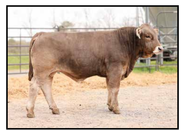
Lot #1- JF LEGACY L301 ET

This bull checks a lot of boxes for a Fullblood herdsire. L301 posted an actual birthweight of 68 lbs. on a short 280 day gestation with solid weaning and scan data. There is power in the blood as he is an own son of our long time donor RS 113H which was the foundation of our Helga tribe. L301 is a maternal brother to JF Bond H007 who has done a tremendous job for JN Braunvieh in Wyoming and is now being sampled nationally.