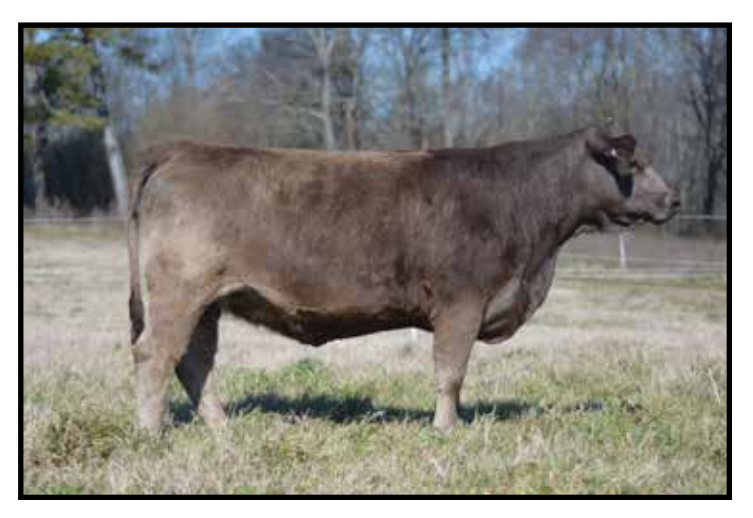
WW GYPSY ROSE 813F ET - Damn of Embryo Lot 46

46A - Heifer calf at side, Ms RDF Lucille 1404L (BC108960), DOB 11-9-2023, BW 76lbs sired by RDF Flagstaff 1145 (BC101224).