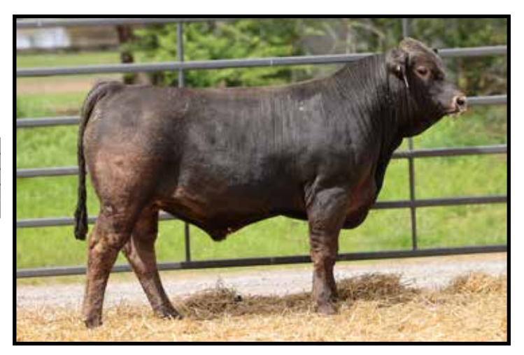
Lot #13 - RDF FIRE WATER 1328L