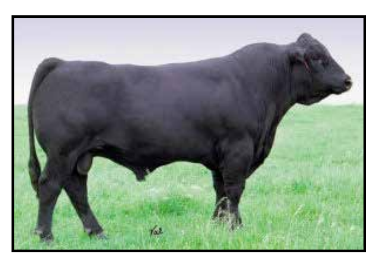
NICHOLS LEGACY G151 - Grandsire of Lot 46