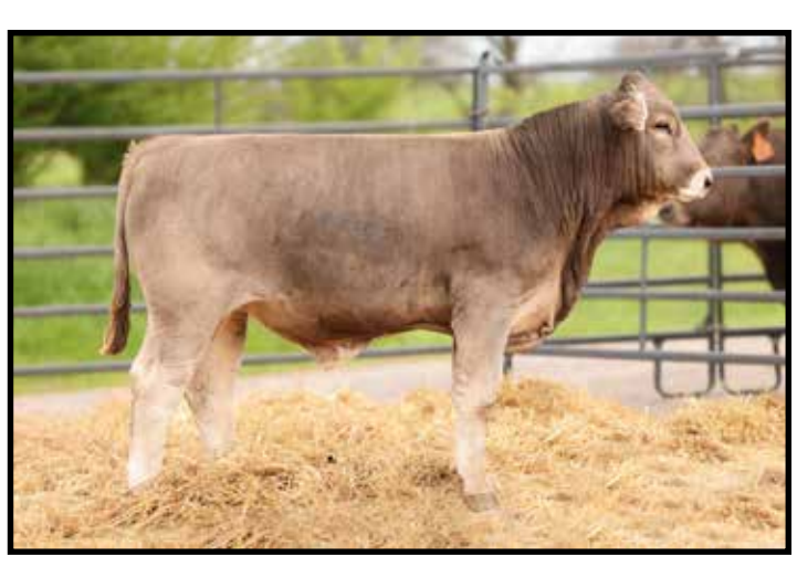
Lot #5 - WIN-V SAM MEX MUCHO L311 ET