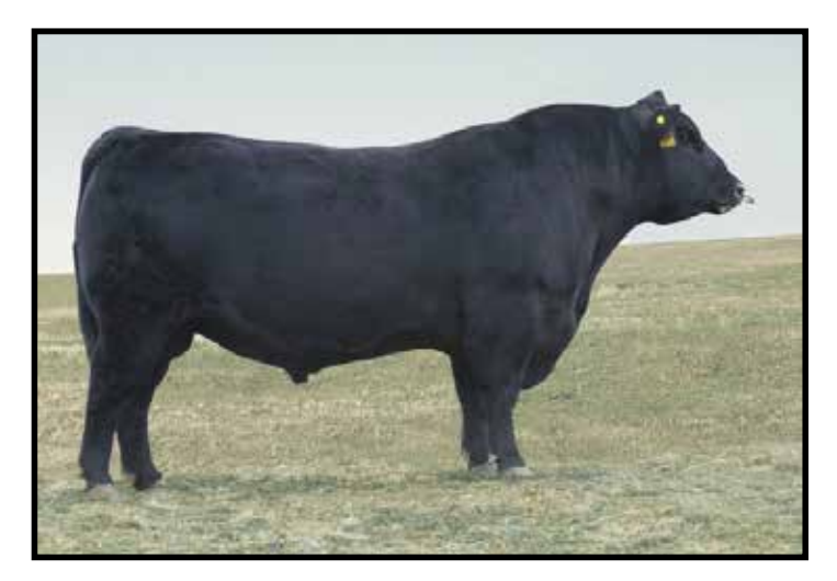
A PROGRAM 5652 - Grandsire of Lot 40

Here's a good example of a true Bran/Angus cow when you put an Angus bull on a Fullblood cow. This cow has been a very productive cow for our program. Exposed to Deacon 452D (PB90240) from 1-10-2024 to 2-20-2024. Checked 35 days pregnant on 3/21/2024.