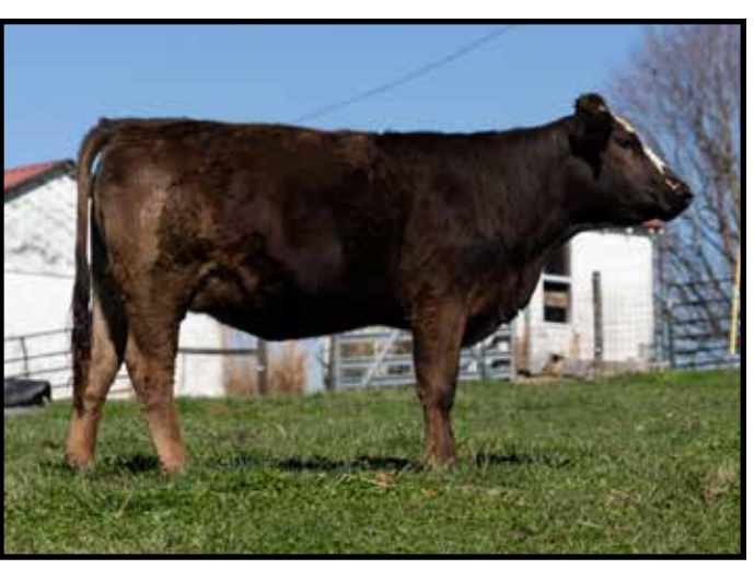
Lot 38 - MS RDF BLAZE 1265K