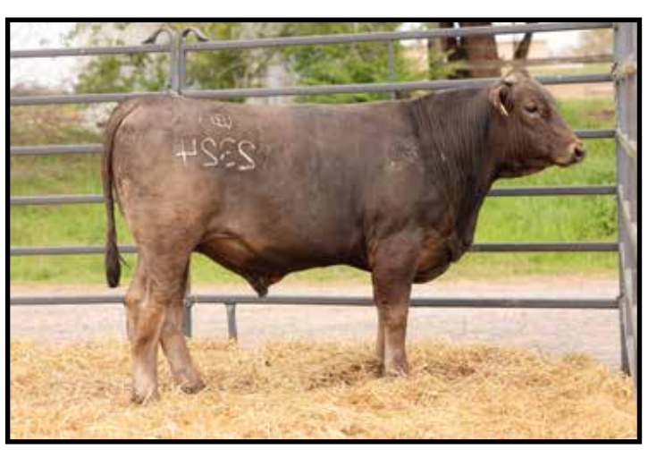
Lot #17 - BF MR LEX LUTHER 2324

Talk about adding longevity, this bull's dam was 15 yrs. old at his birth! With an outstanding pedigree, he will add maternal and paternal traits to your herd.