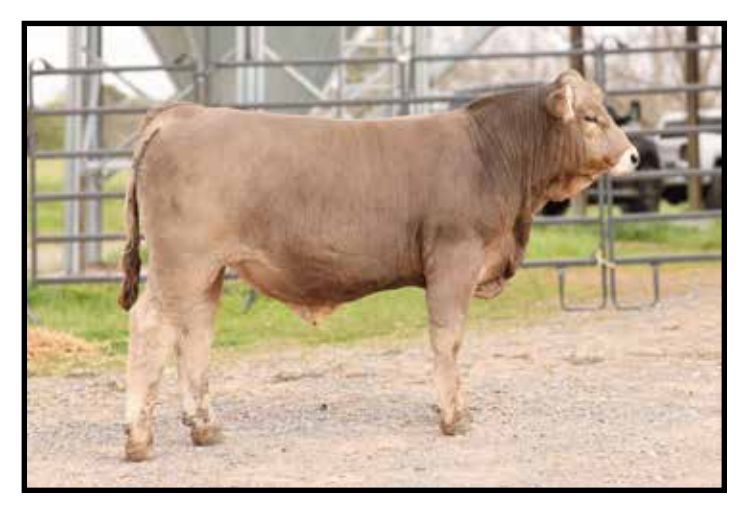
Lot #10 - BF MR LOGAN 2303