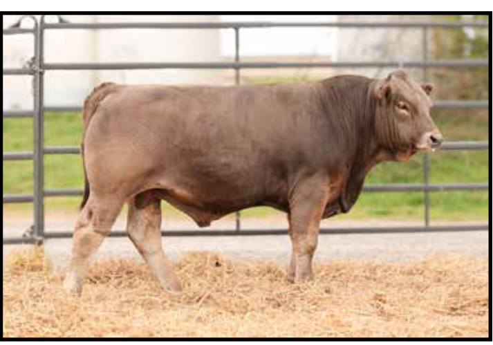
Lot #9 - MR JMS DUSTY L381