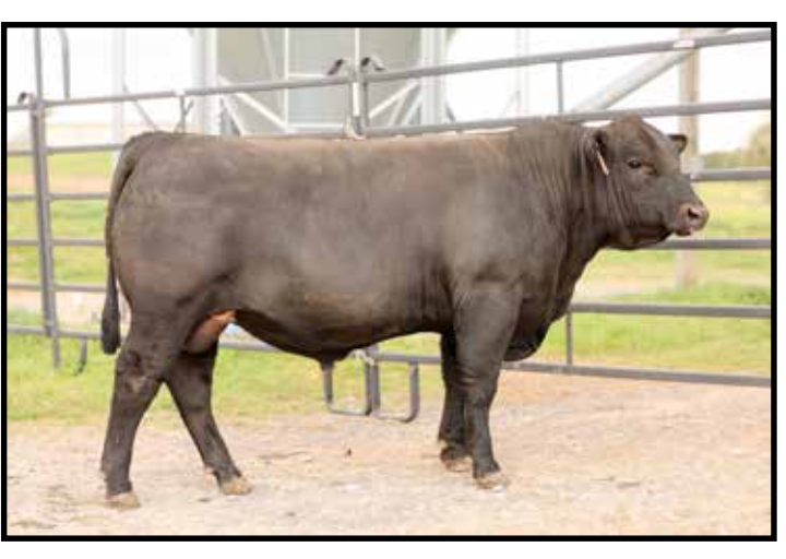
Lot #21 - MR JMS APOLLO L380