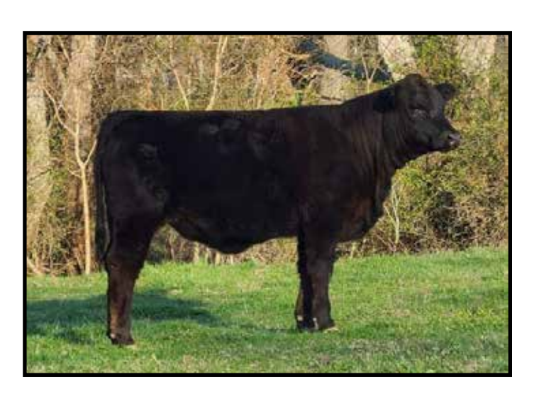
Lot 42 - SRF RUBY 421

SRF Ruby is a double polled, black percentage female. She is in the top 20% for WW, top 15% YW, top 10% milk, and top 20% for API at 122.80. This is the kind of replacement female that will make an impact on your herd.