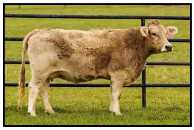
Lot 32 - MISS JMS PIPER H161

A tremendous fullblood cow in the making. She is young and only on her first baby but I think this girl has a big future in her making of an awesome cow. Expected to calve couple weeks prior to sale. 6/9/23, was Al'd to Lover Boy, Reg #2983443 and followed up by Angus cleanup bull, Reg #20023479.