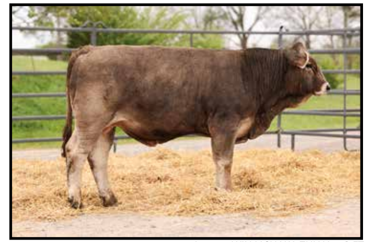
Lot #7 - WIN-V SHAKA ZULU L31B ET