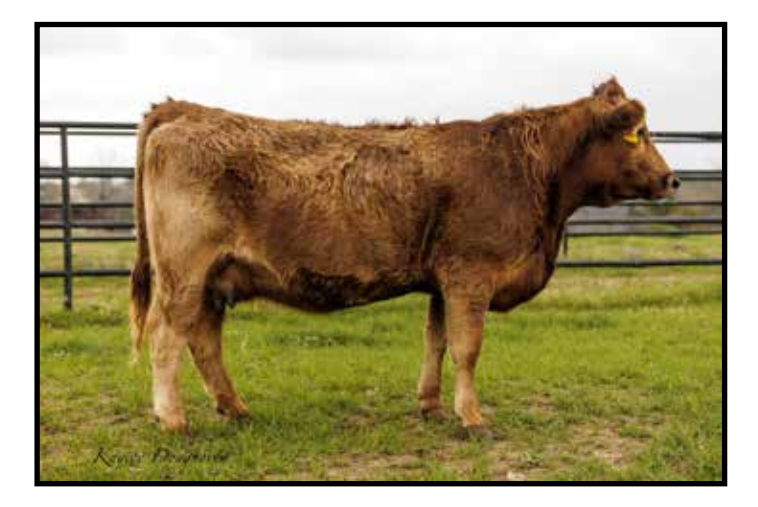
Lot 37 - MISS JMS LACEY K304

If you're looking for a fancy, deep bodied female that is double polled and black then look no further! Her heifer calf at side is a huge bonus! This is the 1st calf we are offering out of our herdisre SFF Mr. Firepower (PB101620), who topped the 2022 National Braunvieh Sale at $17,000. This heifer calf is homo black, and homo polled! What an exciting future this pair has in the Braunvieh breed. Take them home and add them to your program!