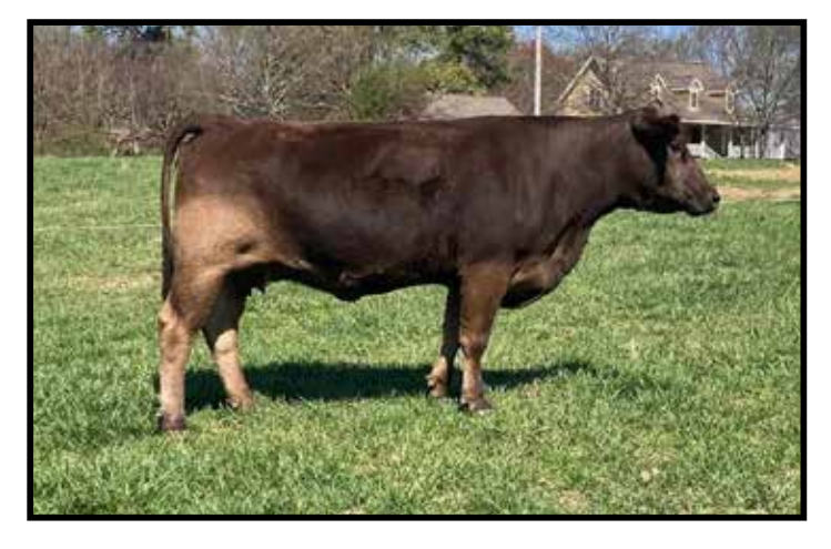
Lot 41 - WW MS 006H

Dam of the top selling Braunvieh Bull at the W/W Cattle Co. Bull Sale, Athens, TN, March 7, 2024, sired by MHF Genesis T737 (NC) ET (PB61566). Pasture exposed to OTF Normandy 202K (PB103565) from 12/20/2023 until 03/04/2024. Confirmed pregnant via blood test on 3/1/2024.