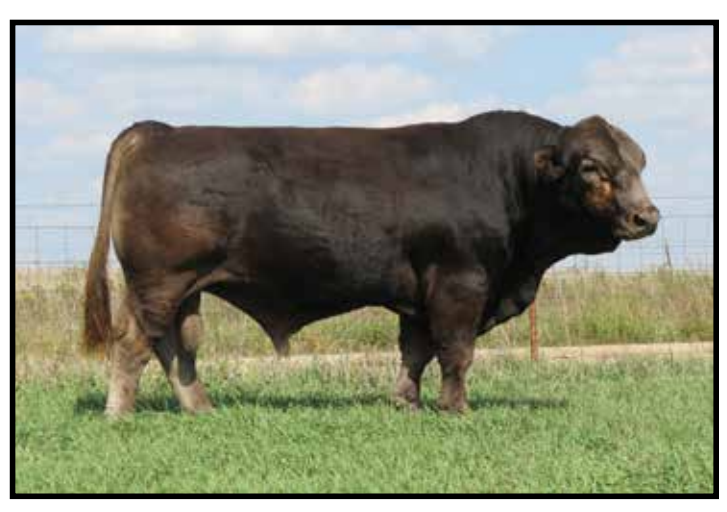
MHF UNDAUNTED U820 ET - Grandsire of Lot 39