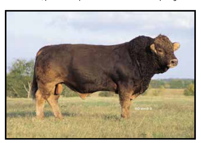
NORTHSTAR VERNON AEB53A-6252 - Grandsire of Lot #30 \,

This powerful, high growth open heifer is the best heifer born on the place in 2023. She represents so much of what we strive to produce in our breeding program. L307 is the result of stacked cow families being the own daughter of the Bethli son Tennessean and a product of our Chispita cow family. Bethli was considered by many as the greatest cow imported to North America from Switzerland. The Chispita/Madona cow family was chosen by Golden Link in Mexico to anchor an infusion of outcross genetics into their storied herd. L307 is not just a paper princess, she has the look, power and performance to match her pedigree.