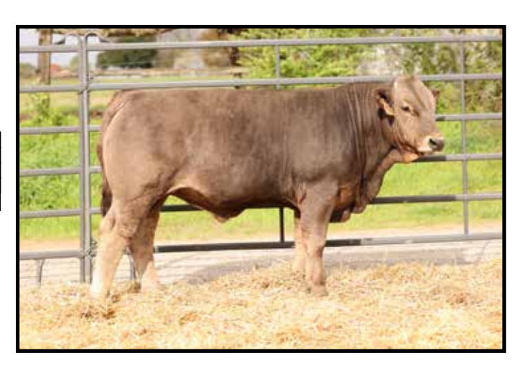
Lot #11 - MR JMS JACE L391

Will be anxious to see this bull in person! When he left the farm to go to test, man, was he stout! No wonder why though, he comes from a WW Cornerstone cow and sired by our best herd sire yet, OB93854 MCB TEB 8018 7421. If this bull produces anything like his sire, you won't be disappointed!