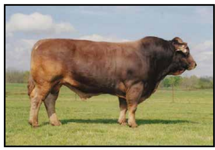
SILVERWOOD DRAGON 4Y - Grandsire of Lot 31

This female is loaded with great foundation full bloods that include Silverwood Dragon 4Y, TLC Anna, Northstar Vernon, WSR A97/1, Hari, and North Ridge Helga!!! Pasture exposed to the Homo Black, Homo Polled sleep easy heifer bull owned by Stillwater Farms, BlackJack (PB102021) from 11-28-2023 to 3-2-2024. Updated pregnancy status available soon.