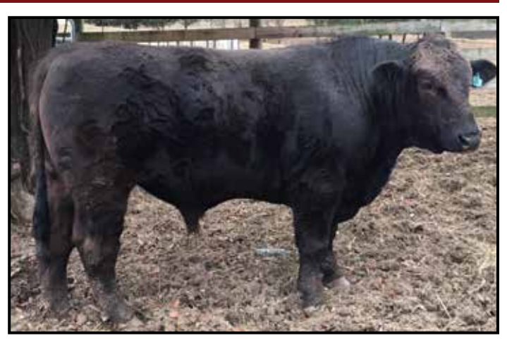
Lot 55 - CANEY CREEK DARK KNIGHT

Homo black and homo polled! Proceeds from sale will go to JBAA.