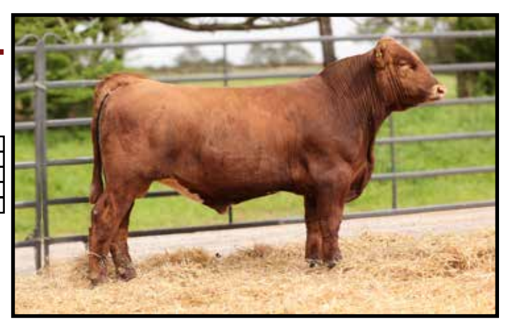
Lot #25 - C4 BIG ORDER L322

Stout and structurally correct with a blend of top-level genetics sums this bull up. Looking at this bull's pedigree you see only AI sires and donor level females on both sides of his pedigree including his dam who serves as a donor for us. This bull will add pounds and dollars to a set of calves regardless of what color they are!