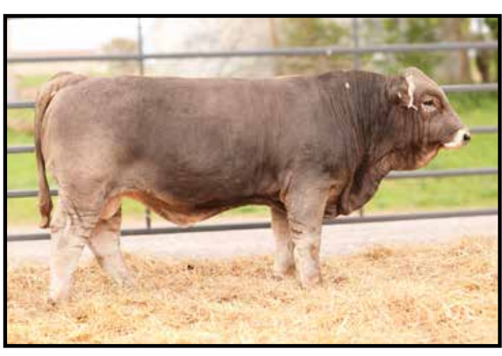
Lot #2 - WIN-V C2 L408