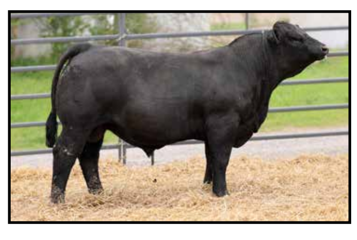
Lot #23 - SRF BRUTUS 209