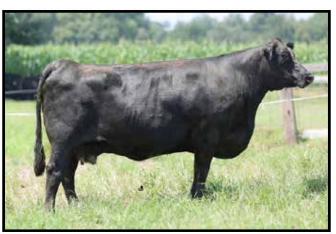
Lot 27 - WOODALL 628 OF 496 CT

A Conneally Thunder daughter that is very powerful and long bodied. Thunder daughters make great females. Her heifer calf 391 sells as lot (29) Pasture exposed to PJDC Teddy Bear (PB81753) 1-10-2024 to 2-20-2024. Pregnancy status will be updated.