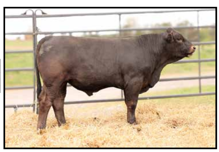
Lot #14 - BF MR LEO 2314

This bull puts it all together. With a ADG of 3.74 lbs/day, he is going to make an excellent herd sire!