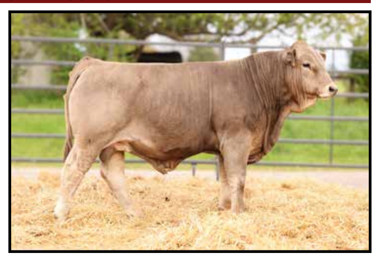
Lot #8 - JF TRANSCENDENT L303

If you are looking for a bull that will add pounds to your calf crop, look no further. L303 weaned off an actual 808lbs and was over 1250 lbs. at yearling. Sired by XC Bar's Calgary 71D out of a JF Gage L103 dam, L303 is a nearly complete outcross polled herdsire that follows in a long line of high performance cattle produced by his dam, JF Helga A304.