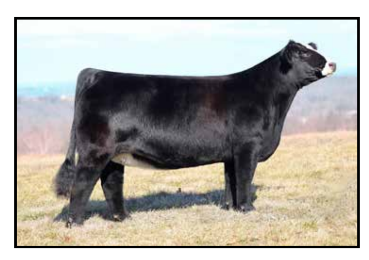
HPF ALLEY 397E - Dam of Lot 44