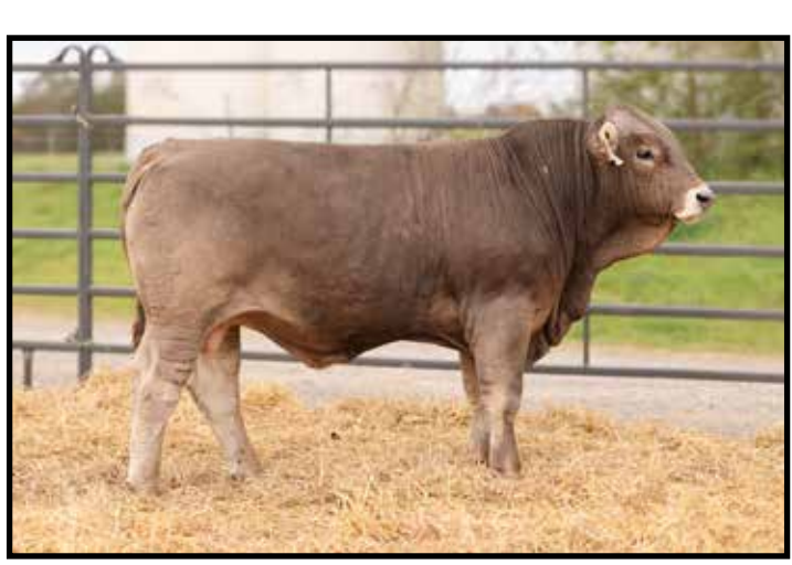
Lot #3 - WIN-V JIVAN L305 ET