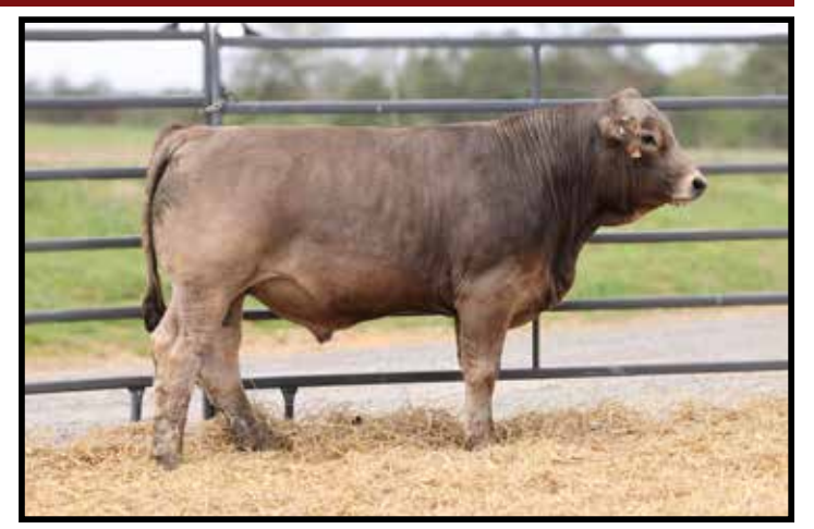
Lot #16 - RDF DEACON 1329L