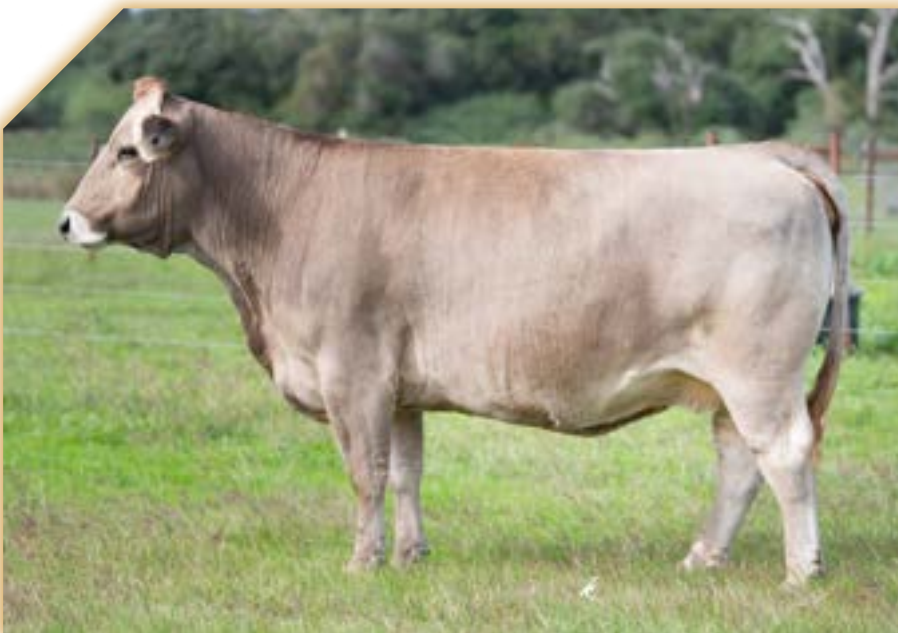
MISS HLJ GOLDEN ROSE ET | GRANDDAM OF LOT 18