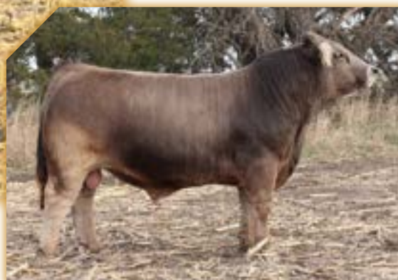
WCCR GRINDSTONE 3120 | SON OF WCCR DIXIE DARLIN 0068