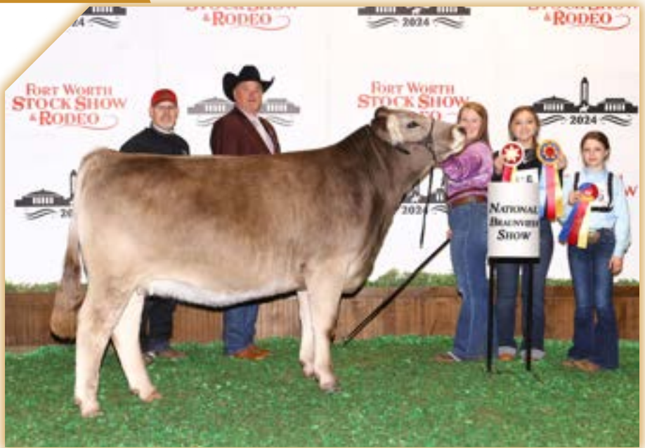
MISS JMS BETH K312 | PATERNAL SIB TO LOT 17