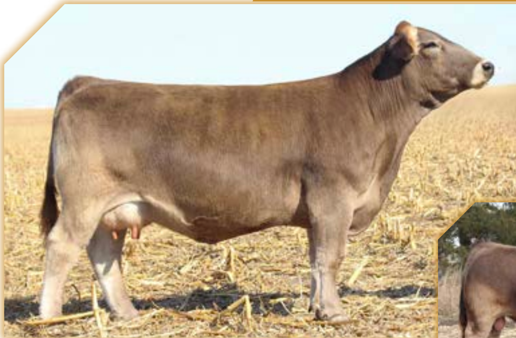
WCCR DIXIE DARLIN 0068 | FLUSH SELLS