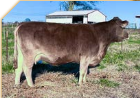
WW FIELDSTONE JASMINE 229Z ET