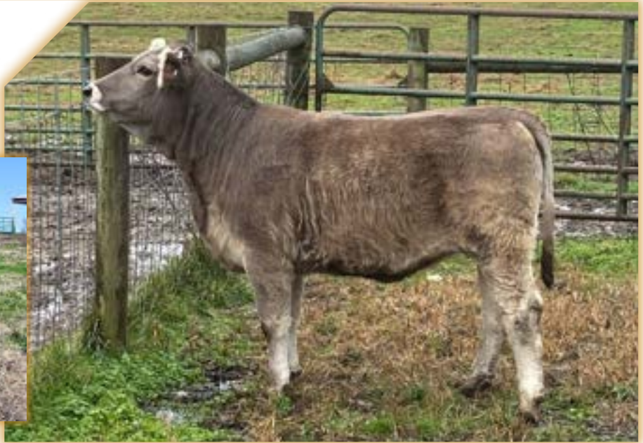
LOT 21 | HALF SIB TO LOT 22