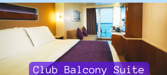
Club Balcony Suite

Sailing Round-Trip from Athens, Greece July 4, 2024 through July 14, 2024